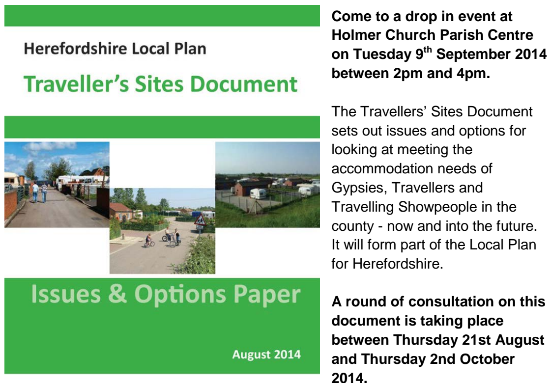
Figure 2 – Image of drop-in event poster

Posters were produced to advertise the consultation and particularly the drop in event in September. The majority of these were distributed to existing Traveller sites with the intention that they encouraged attendance at the drop-in event. Some were sent to the Hereford Traveller Support Group representative to distribute, with their agreement. A copy of the poster is shown in Figure 2.