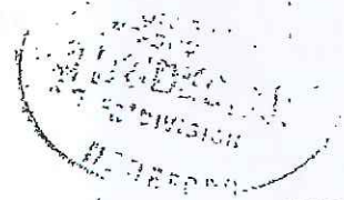
PHOTO-COPY FORWARDED TO ..... E ..... DIVISION ON 15/12/81 FOR ACTION INDICATED AND ..... ON