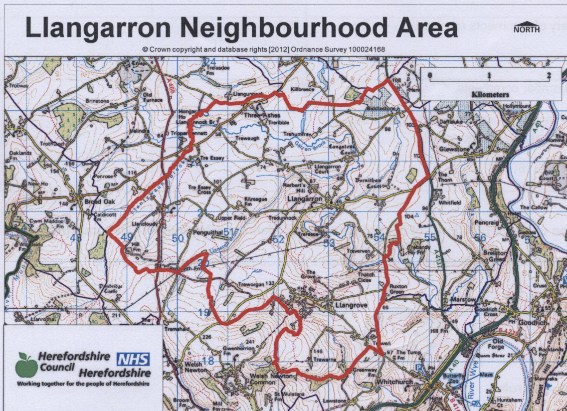
Map of proposed neighbourhood area