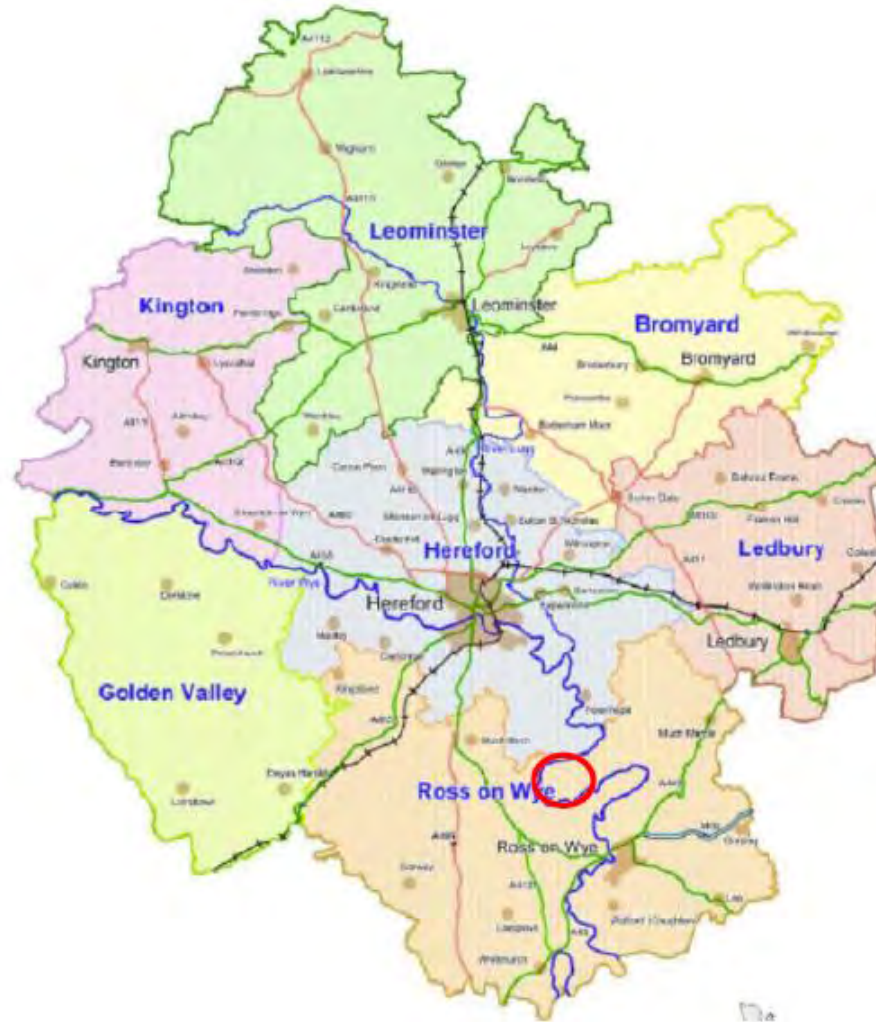
Figure 2 - Location of Kings Cuple Parish within Ross on Wye Housing Market Area.