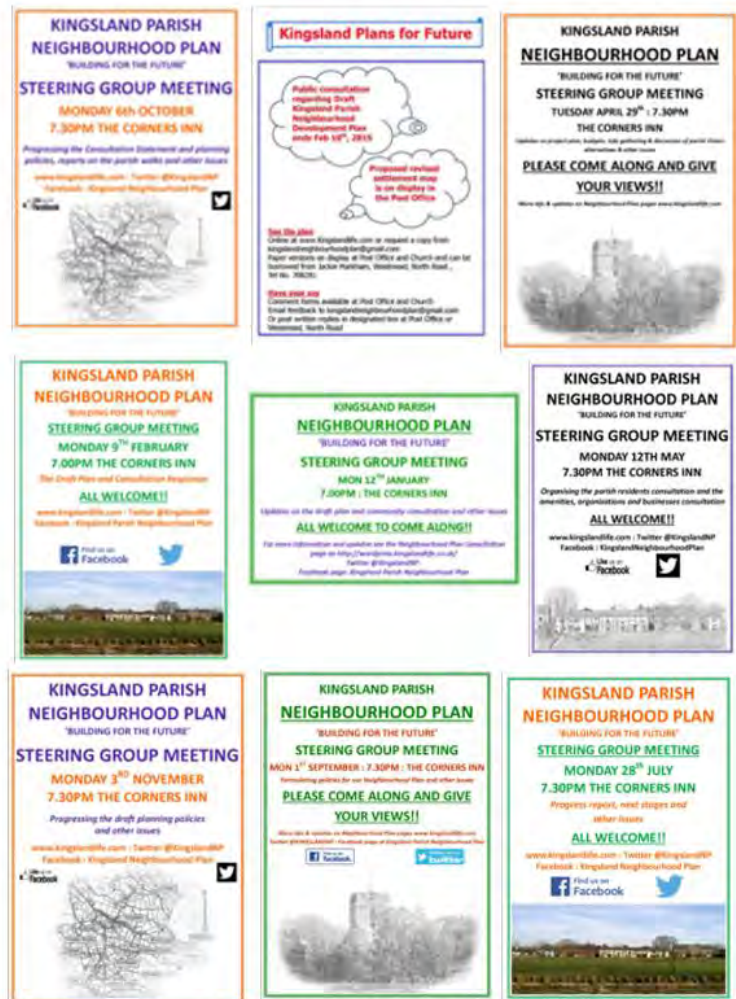
Figure 3. A few examples of the posters and leaflets used to advertise every steering group meeting and public consultation event

5.3 A contact address has been added to each piece of publicity with an invitation for comments. These have been few but have been discussed at the meeting after they were received and a response agreed.