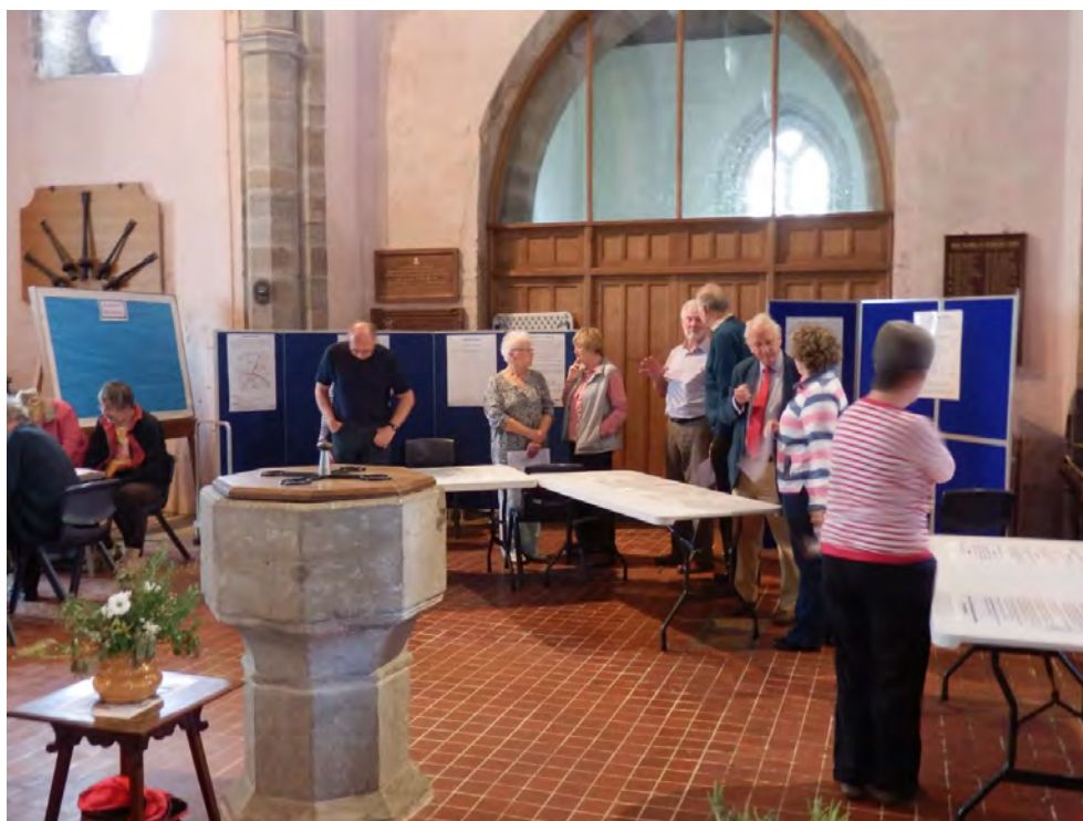
Additional Consultation in relation to Shirlheath and Cobnash held at St Michael's and All Angels Church Kingsland on September 4 th & 5 th 2015

The Neighbourhood Plan Steering Group considered the responses received at its meeting on 7 th September and agreed that development boundaries could be provided for the two settlements although agreed to variations to take into account concerns expressed. These have resulted in the boundaries shown in the submitted plan.