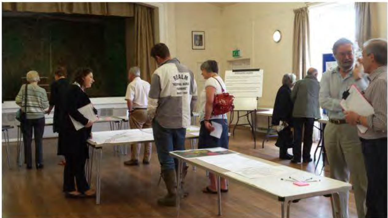
June 2014 - Two-Day KNDP event at Coronation Hall, Kingsland

The sub-group was formed to plan a major NDP community event. It was agreed that the event would focus on the key findings from the parish plan consultations and use these to develop a draft vision , a set of draft objectives , and outline criteria and options for the Kingsland's Neighbourhood Development Plan. The community would then be invited to give feedback on these four elements.