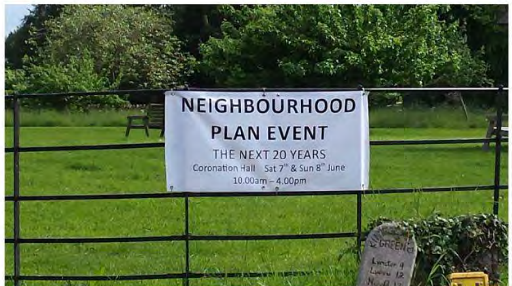
June 2014 - Banner advertising Two-Day NDP Consultation Event

5.4 Banners were also used to advertise the 2-day KNBP event in June.