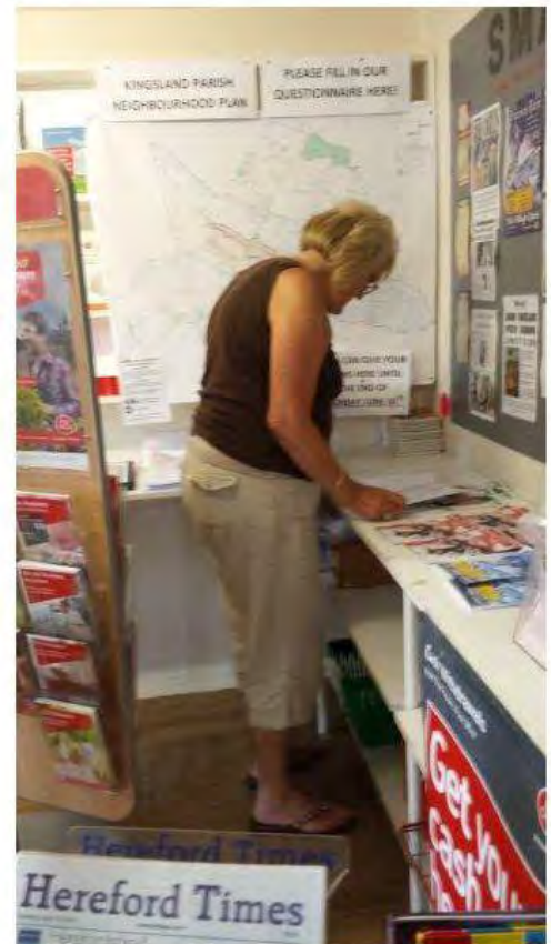
June 2014 - NDP Consultation display in Kingsland Post Office

This enabled the Committee members to visualise the areas under discussion and observe whether the criteria, objectives and policies were viable. The walks information was written up as part of the evidence base and can be viewed at: