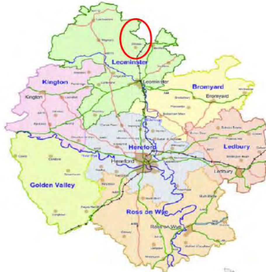
Figure 2 - Location of Orleton and Richards Castle Parishes within Leominster Housing Market Area.

© Crown copyright and database rights (2015) Ordnance Survey (100024168)