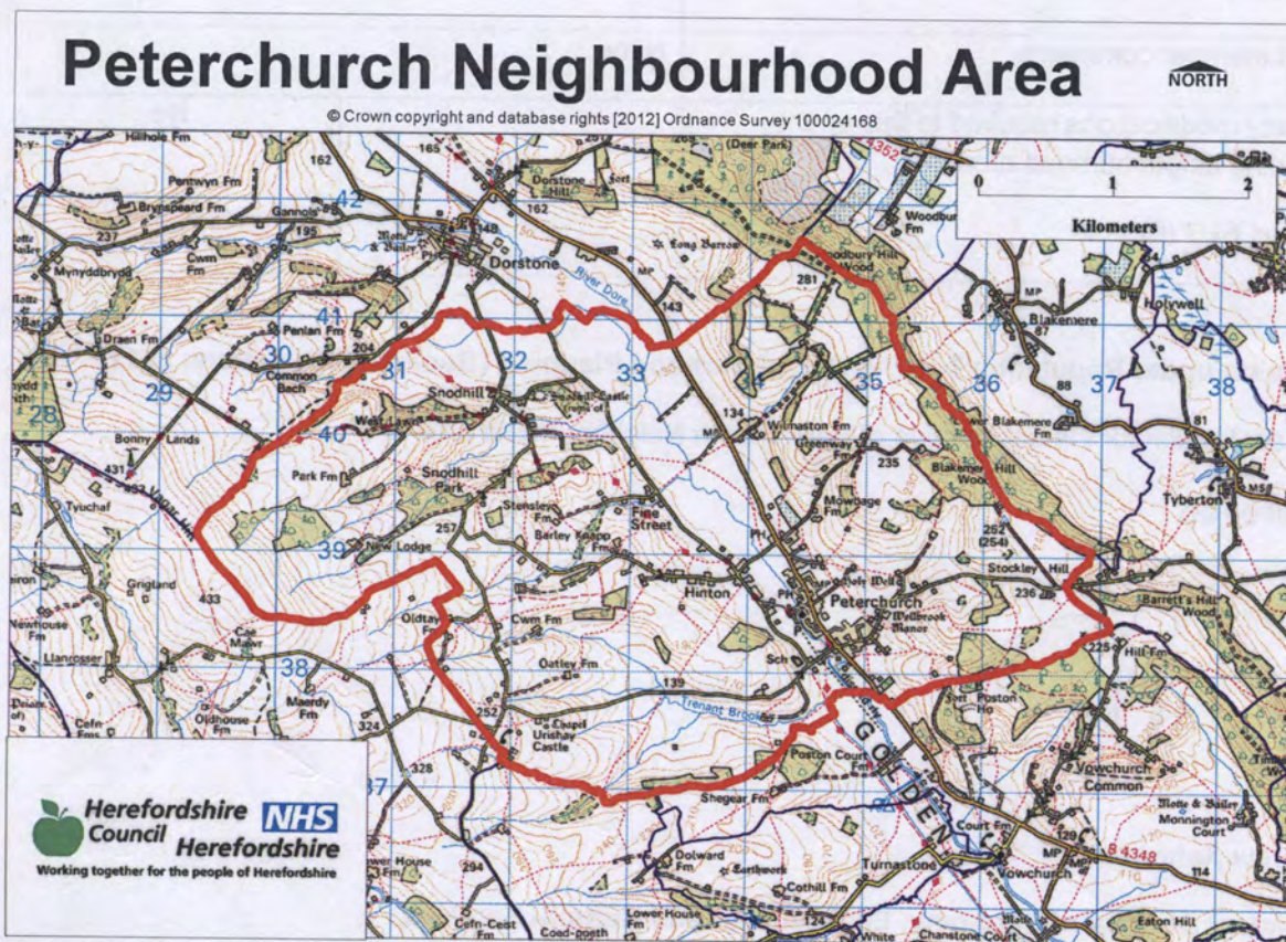
Map of proposed neighbourhood area