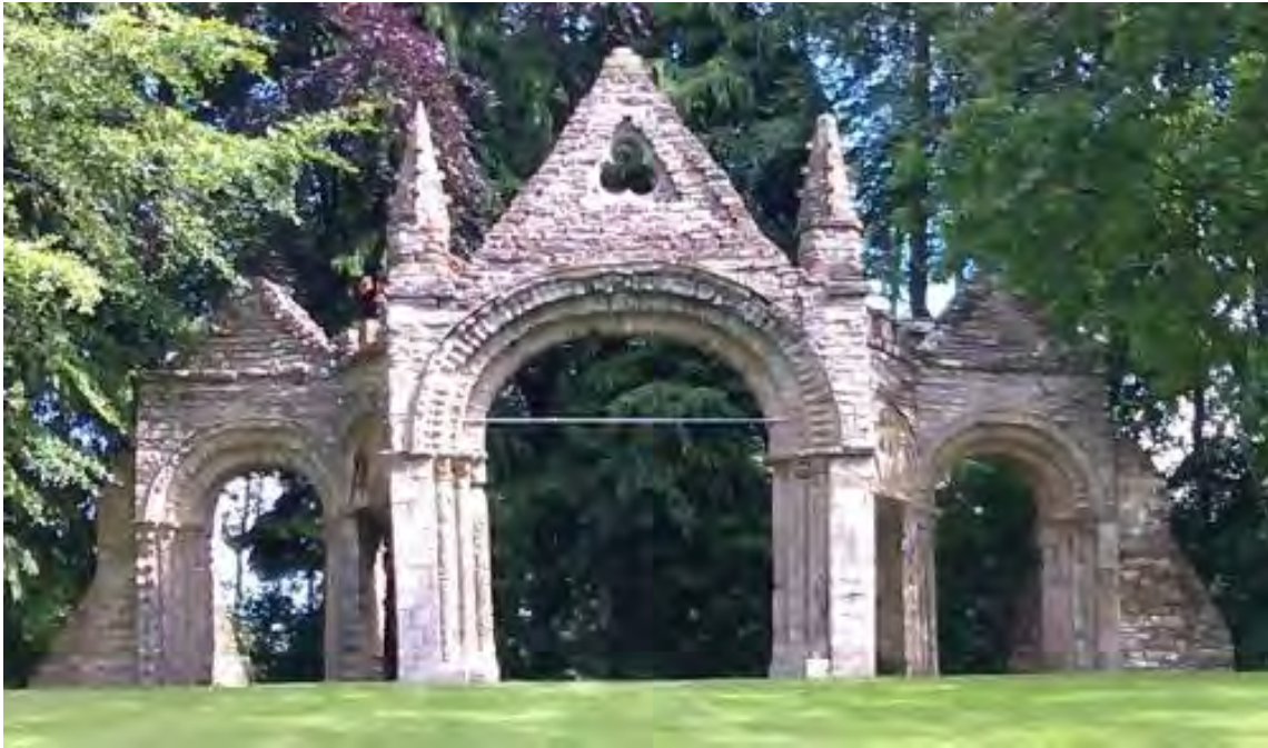
Figure 2: Shobdon Arches

This was circulated to 663 adults over the age of 18 and had a response rate of 66%. A young person survey containing 14 questions was also undertaken with 31% of the 153 present between the ages of 5 and 17 responding. The December 2014 consultation event sought views upon a vision and objectives for the Neighbourhood Plan and also upon the general direction that policies covering a number of issues might take. These have been used to inform this plan and further details of the consultations undertaken will be included in a Consultation Statement to be prepared for submission to the Inspector appointed to consider the plan after further formal community consultations have been undertaken.