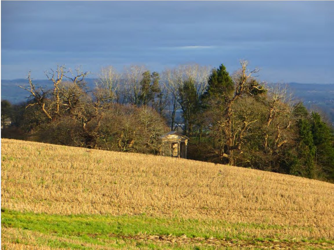
Figure 1 – The Folly, Shobdon Park

which also accommodates a pre-school group and community hall. Shobdon Airfield and premises on its periphery provide a significant number of local job opportunities ranging from engineering to tourism. The airfield also provides a range of recreational activities. Further tourism related job opportunities exist especially through Pearl Lake Caravan Park and the Mortimer Trail passes through Shobdon Wood. Agriculture remains an important activity and again utilises premises on Shobdon Airfield for bulk storage.