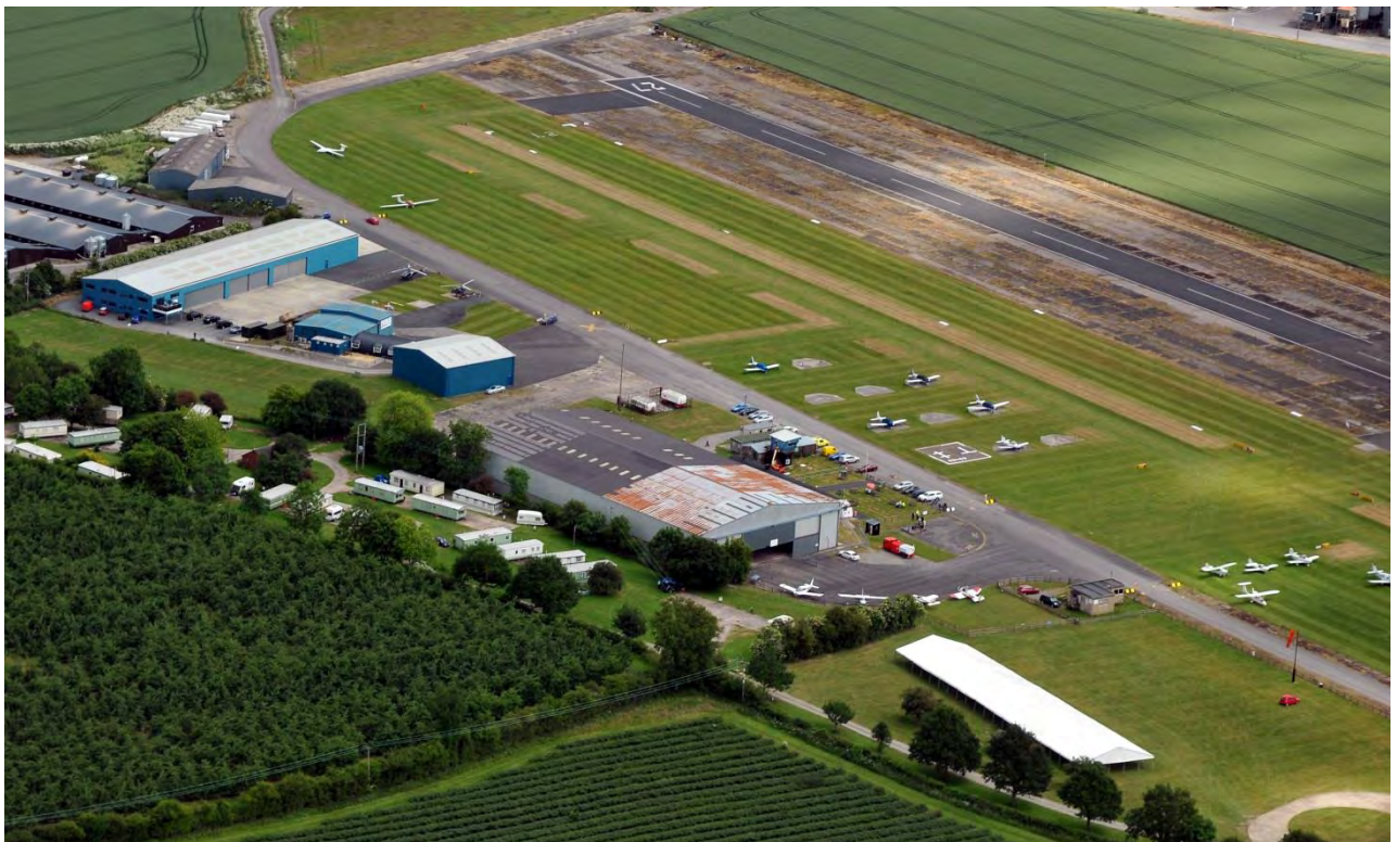
Figure 5 - Shobdon Airfield

'moderate' in terms of quality by Herefordshire Council. Heavy traffic travels principally through Shobdon village to the businesses in or surrounding the Airfield because of the restricted access along the road leading from Pembridge. There are highway and utility constraints which may restrict many forms of expansion beyond the present level of activity. Herefordshire Core Strategy Policy E2 would not necessarily seek to retain all these premises in employment use but with regard to the main complex on the Airfield would require certain conditions to be met should an alternative be proposed. In all instances the provision of ancillary and complementary uses which help meet the day-to-day needs of these sites and their employees and improve their attractiveness to businesses, will be permitted where they are of a scale which does not impact on the overall supply of employment land.