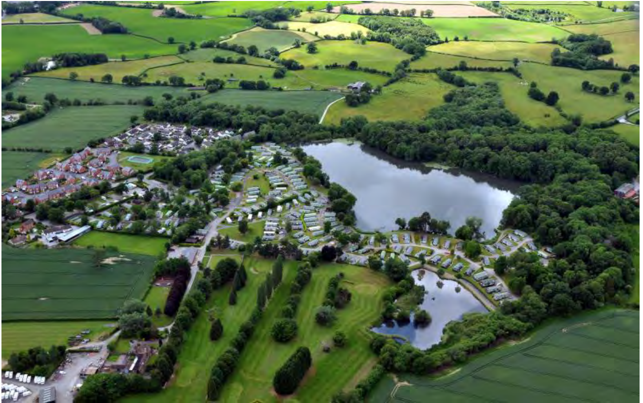
Figure 6 - Pearl Lake Caravan Park