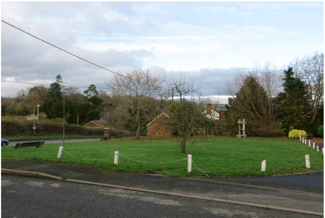
Figure 7 – Local Green Space at Hanbury Green