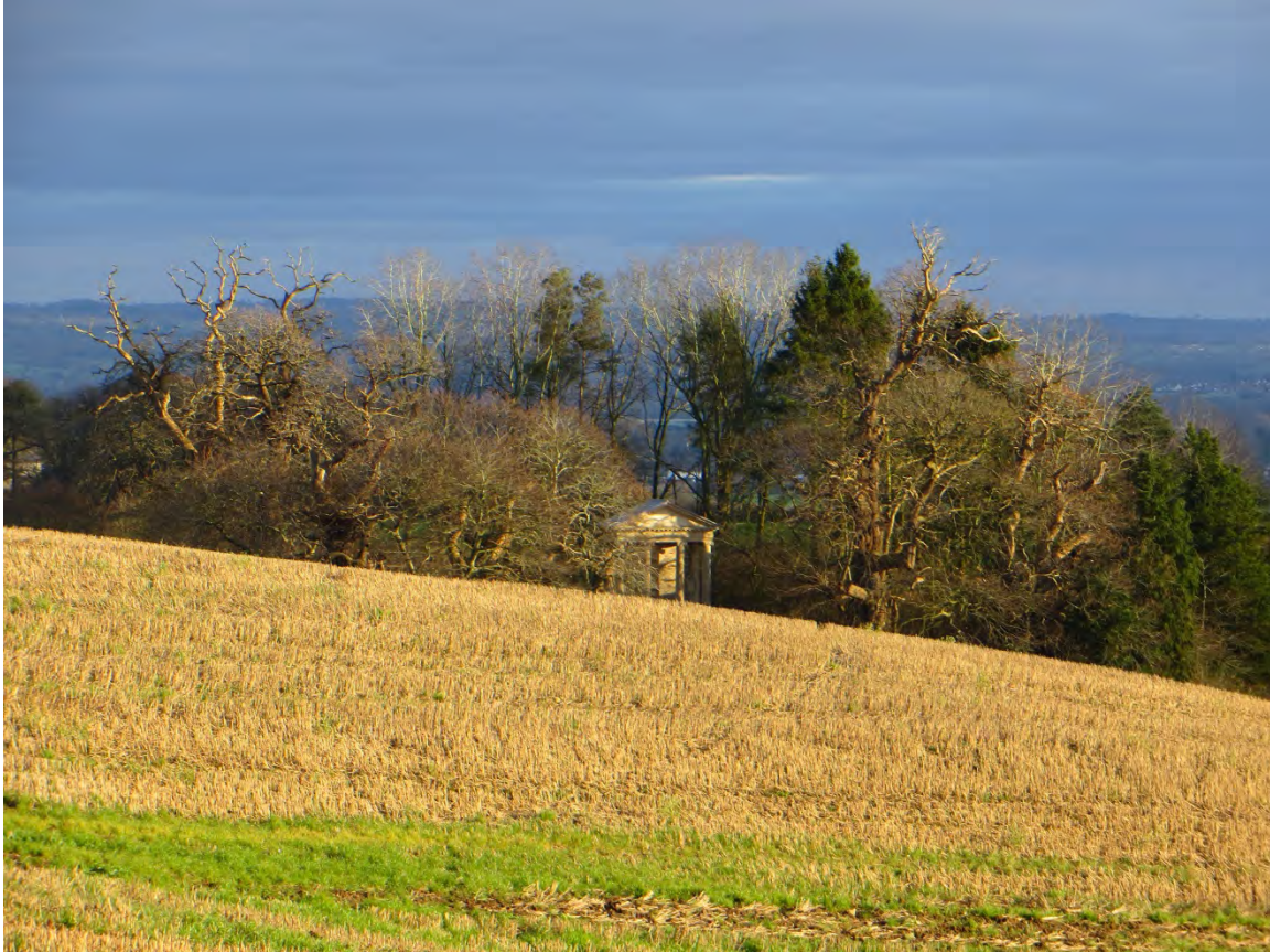
Figure 1 – The Folly, Shobdon Park