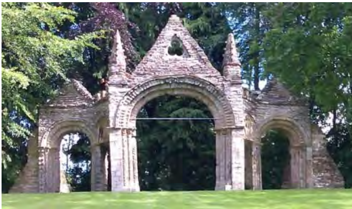
Figure 2: Shobdon Arches

Arches relocated in the eighteenth century to their current position at the end of a tree lined avenue.