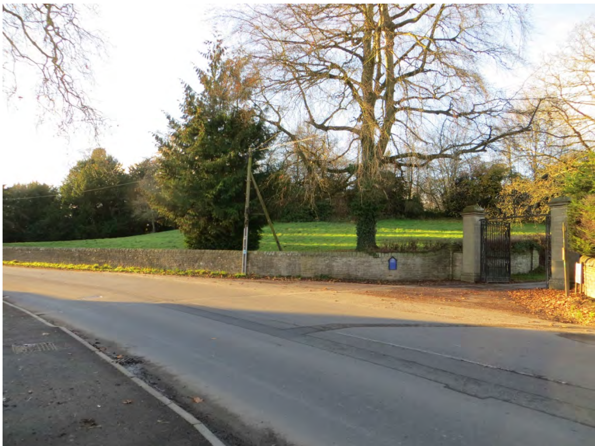
Figure 8 – Local Green Space on North side of Main Road either side of the stream passing under Shobdon Bridge