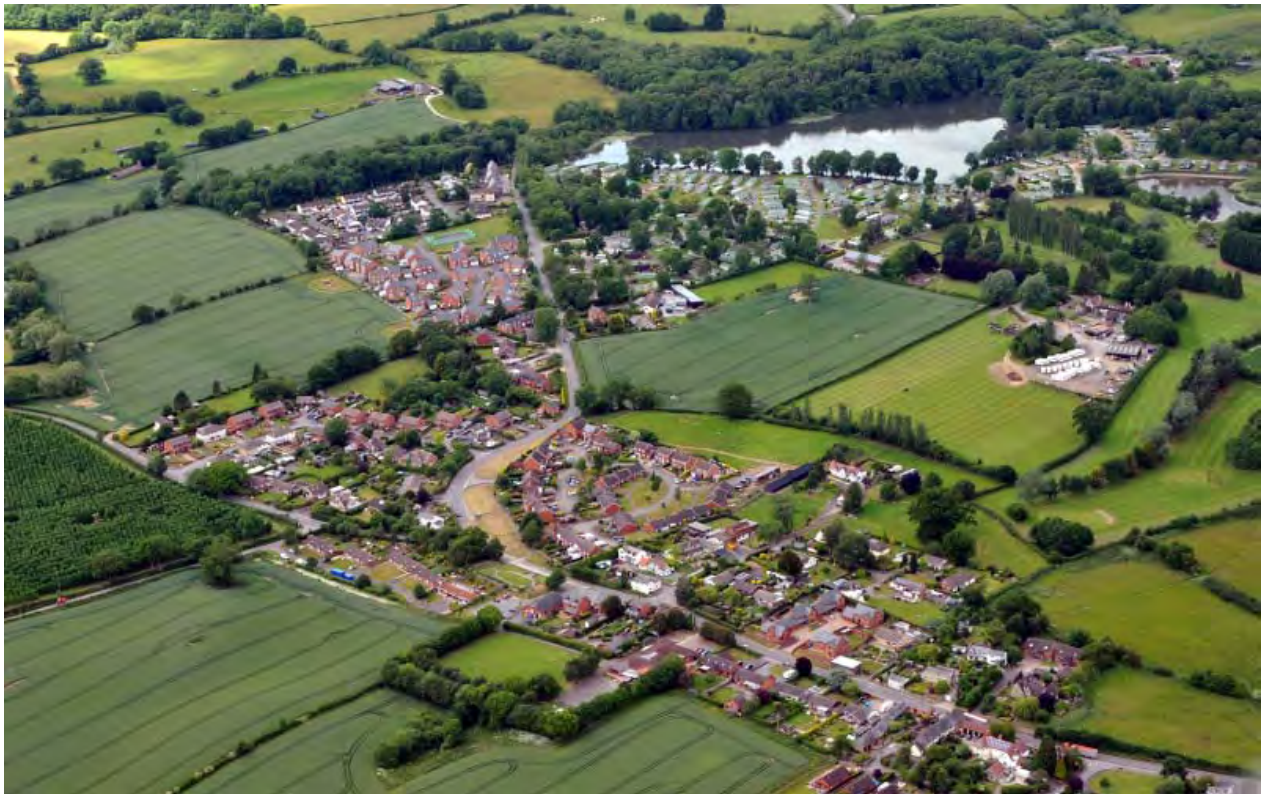
Figure 4 – Shobdon Village

3.4 The local community is conscious that the B4362 cuts through the parish and village, and is highly trafficked through being used by heavy and fast moving vehicles. The road provides a link to central Wales and also to a number of relatively heavy industries in the vicinity, including around Shobdon Airfield. As the village grows there are increasing concerns that measures are needed to address safety concerns resulting from traffic and the effect this has on amenity. The ability of other local roads to accommodate the increasing size of vehicles is also a concern. Shobdon Parish Plan places the issue at the forefront of matters that it wishes to see addressed and this has been reflected in this neighbourhood Plan also.