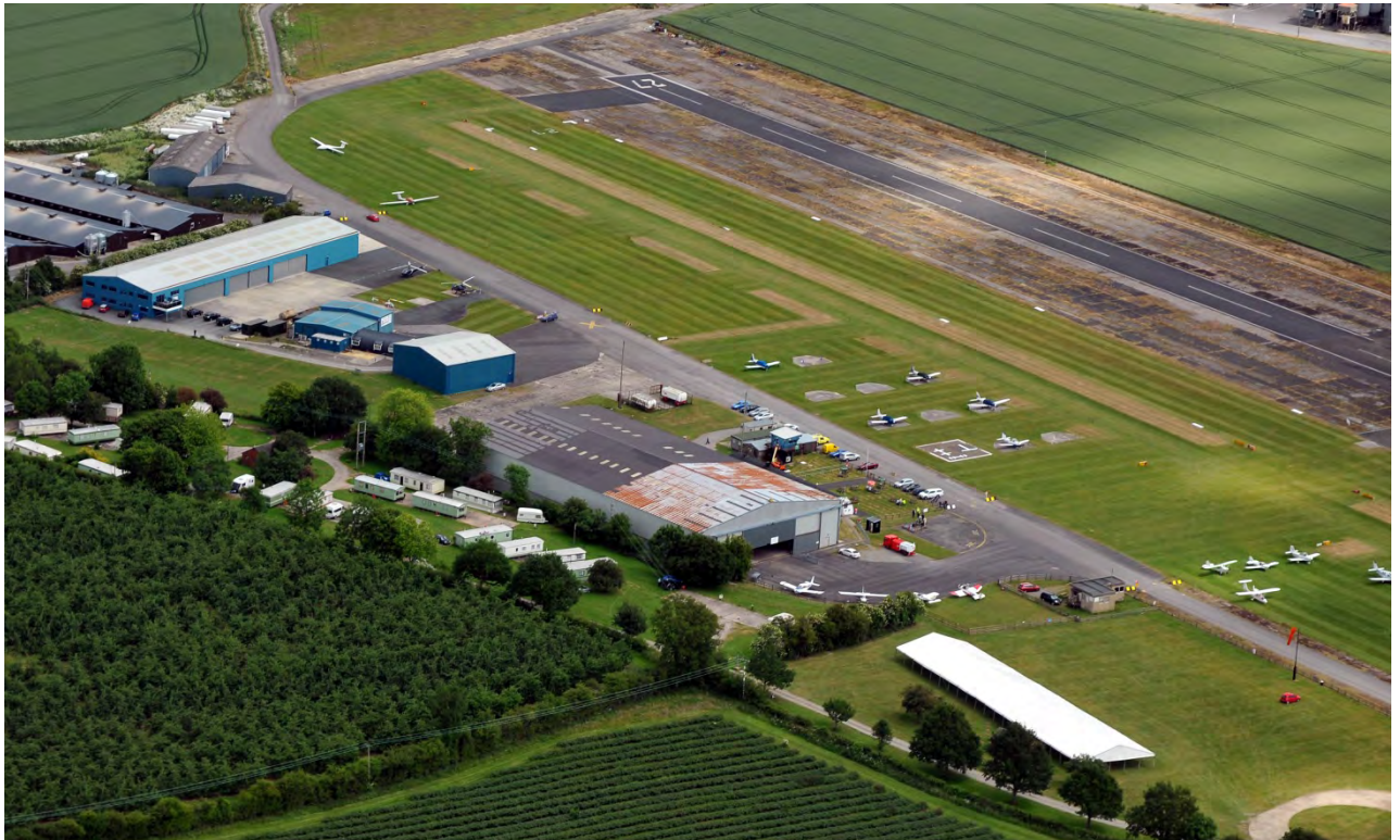
Figure 5 - Shobdon Airfield

various leisure and recreational activities, industry, commercial operations and intensive poultry units. The airfield is used principally, although not exclusively, for pleasure flying. There is no doubt that the area has, through historical reasons, become important as an employment centre with its many buildings being used for a variety of purposes.