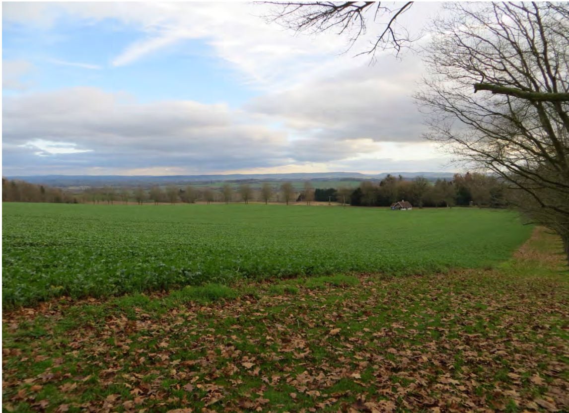
Figure 3 – Long distance view southwards from Shobdon Arches