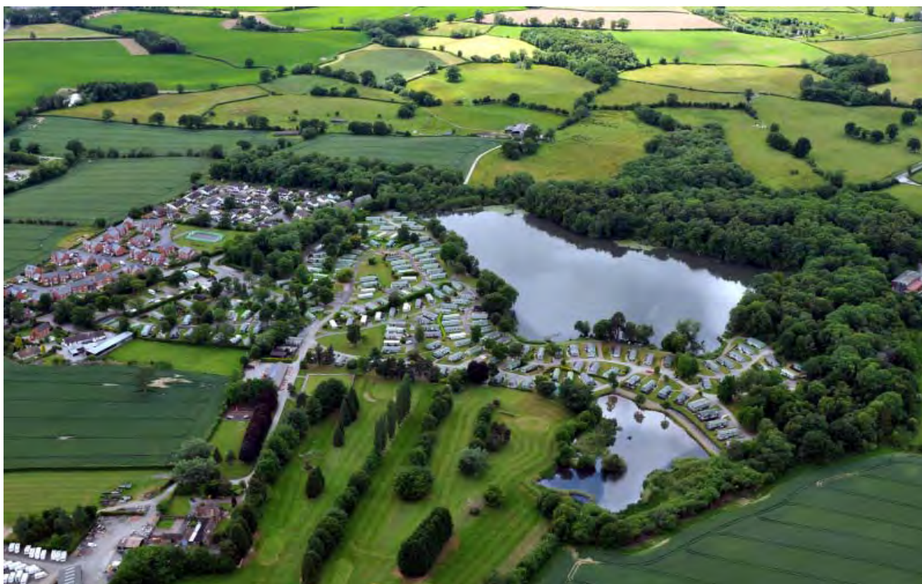
Figure 6 - Pearl Lake Caravan Park