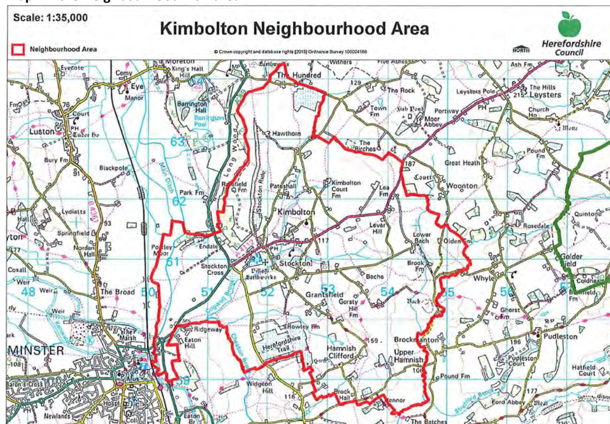
Map 1 – the Neighbourhood Plan area

1.0.2 The area is in the main deeply rural, tranquil and retains much of its traditional historic character. The landscape of the Parish is in two distinct parts - the central and eastern areas are made of up gently rolling elevated countryside which rise steeply out of the Herefordshire lowlands and provides a number of spectacular far-reaching views to the north and north-west. The western parts of the Parish are low-lying and contain important transport routes linking north Herefordshire with Shropshire. Here, the impact of modern farming practices and development pressures is more obvious, reflected in the open character of the landscape, and the presence of large commercial buildings.