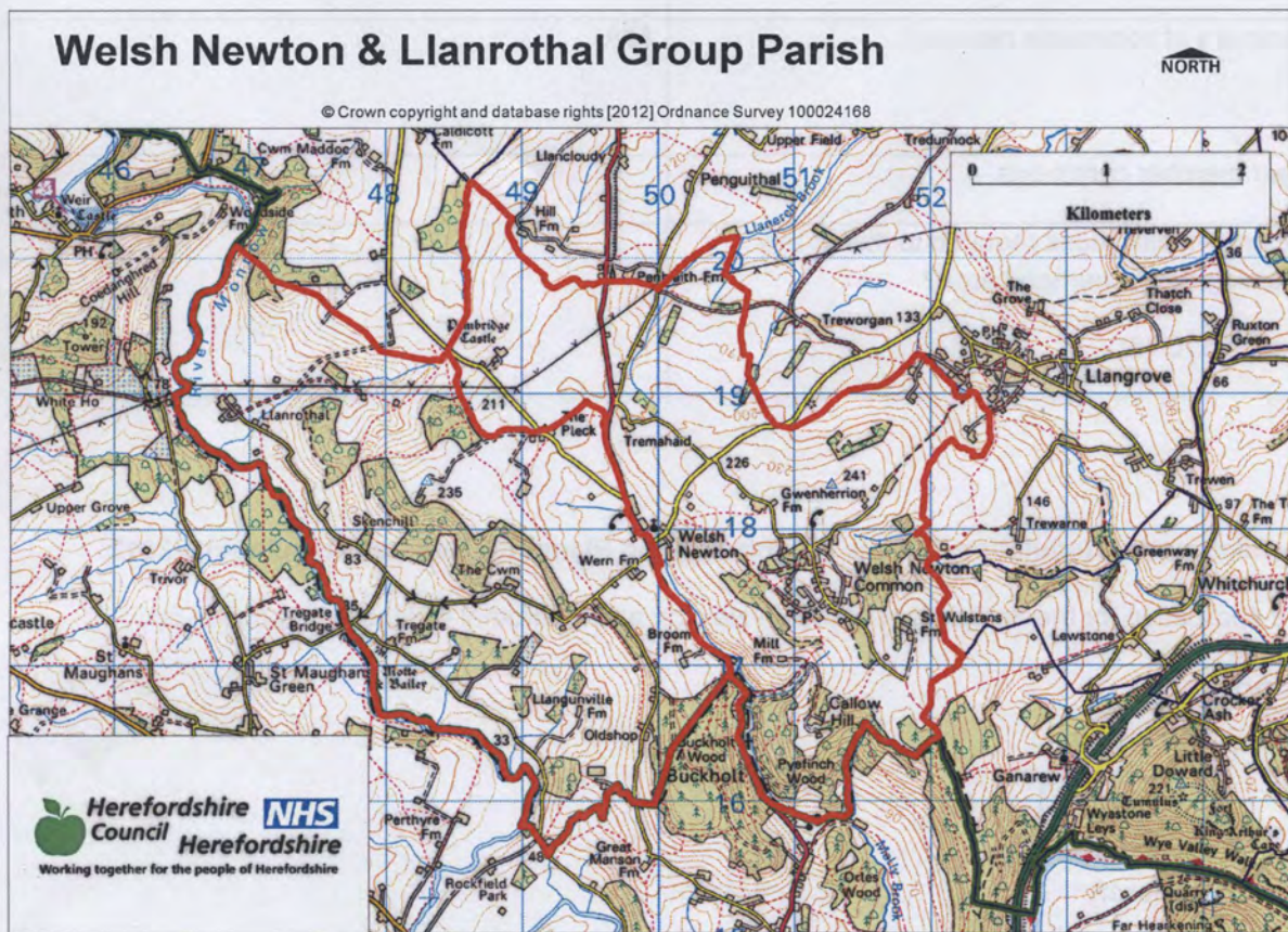
Map of proposed neighbourhood area