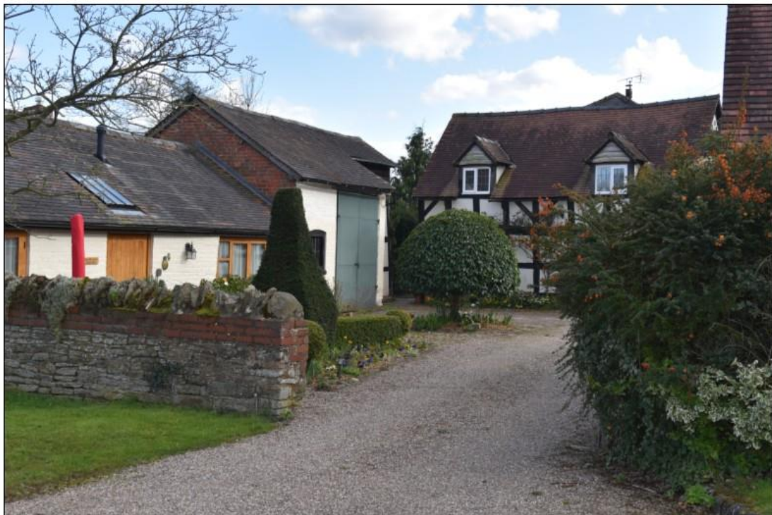
YARPOLE Upper House Farm