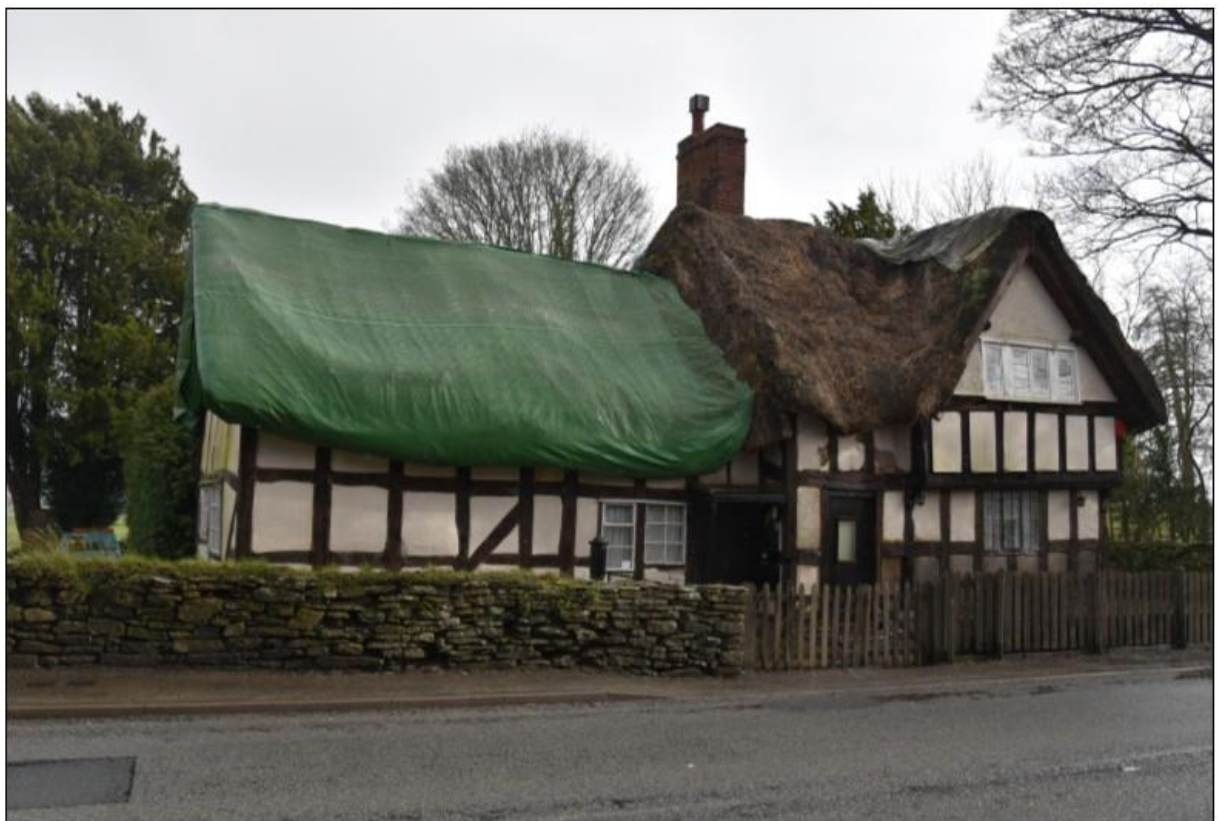
BIRCHER Knoll Cottage