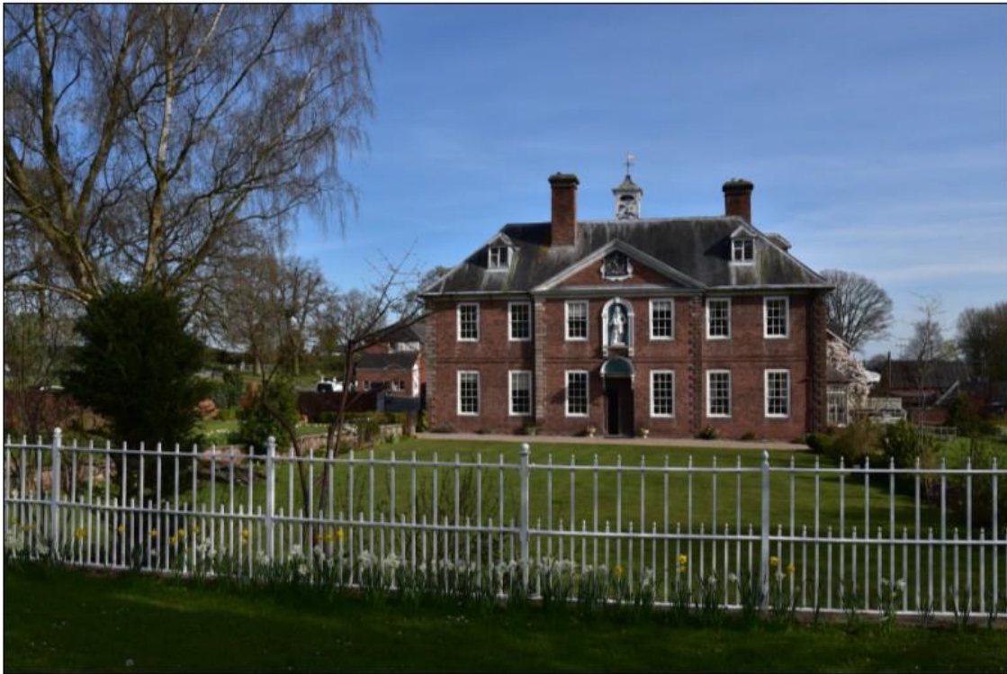
LUCTON School Est.1708