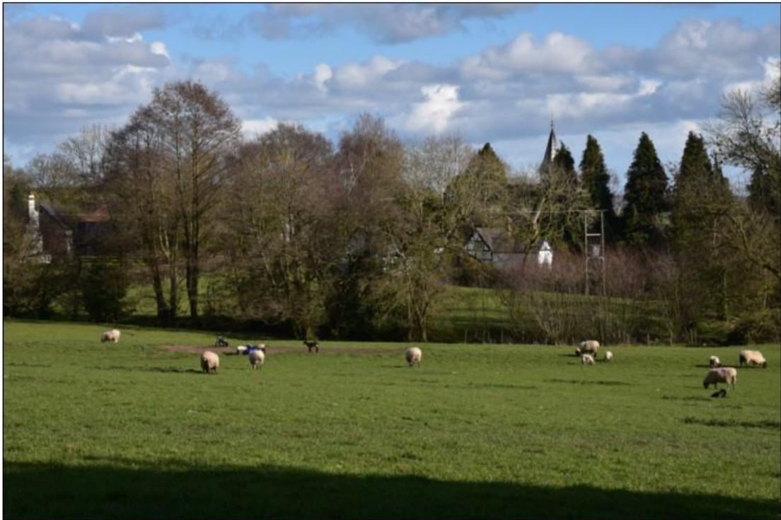
LUCTON Archaeological site

5.3 The orchard separating Orchard Bungalow from the settlement boundary is an important feature recognised in previous local plans, is still important in relation to the setting of the village and adjacent earthworks, and the gap should remain.