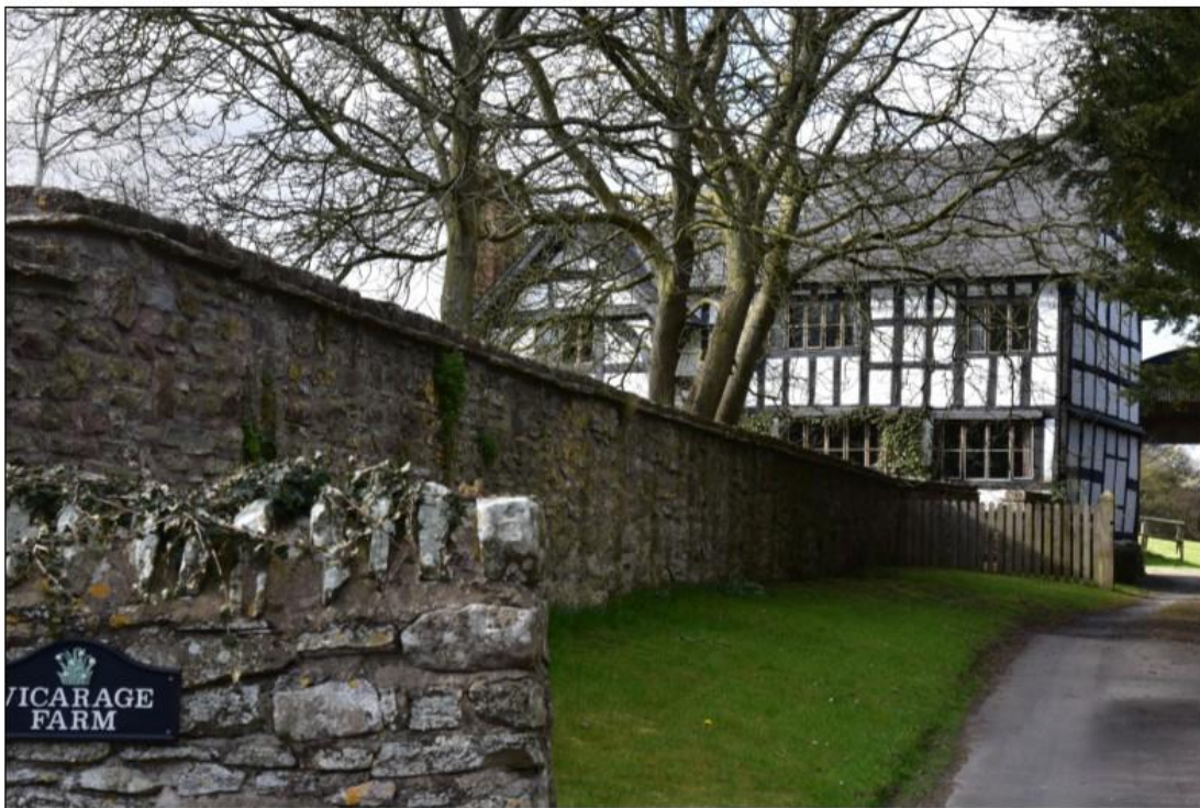
YARPOLE Vicarage Farm

6.18 The land in front of Vicarage Farm and that opposite comprising the graveyard contribute to an open green space within the village centre in the foreground of St. Leonard's Church and its separate square tower just to its south. This policy therefore seeks to protect the setting of these Listed Buildings as well as the retention of green infrastructure. It continues the protection given to these areas in the former Herefordshire Unitary Development Plan.