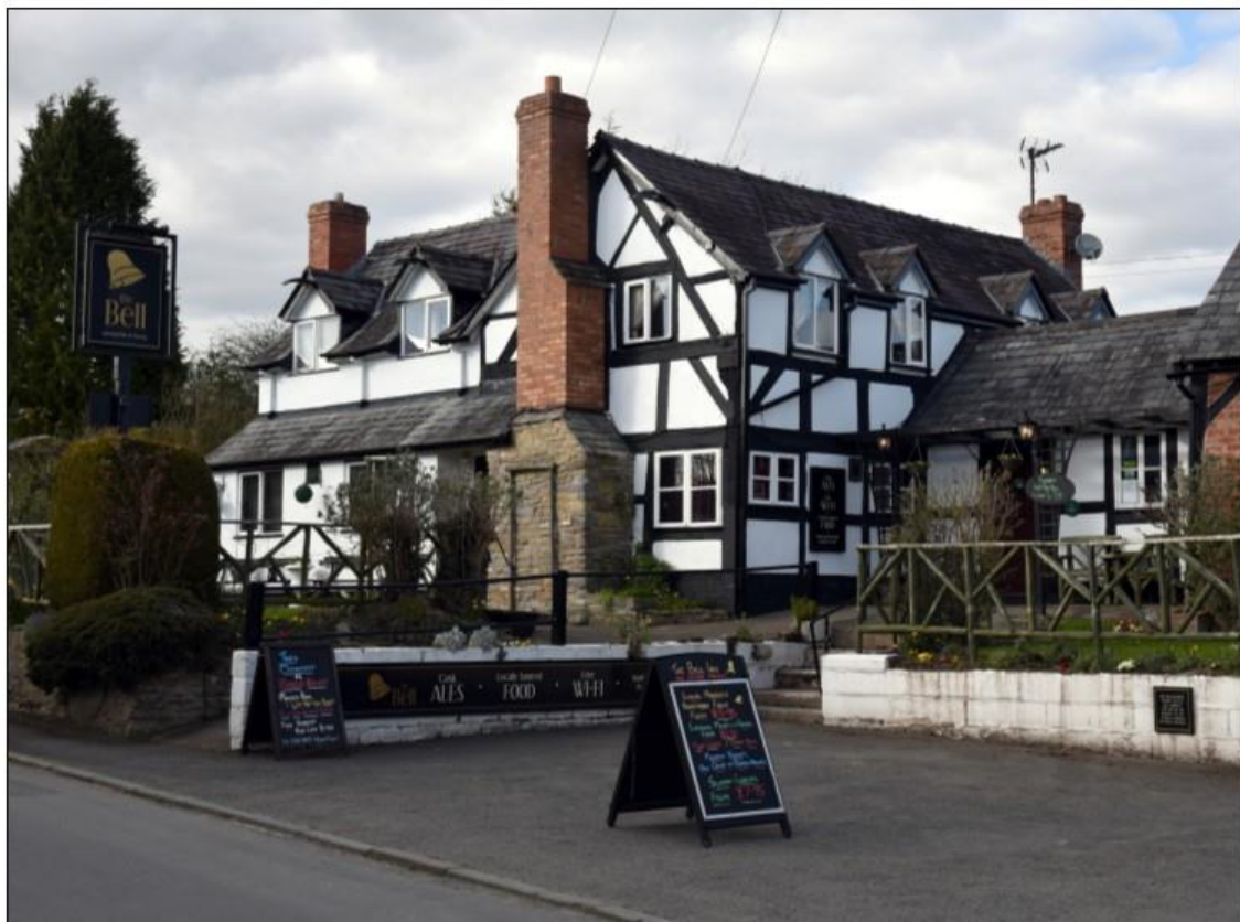
YARPOLE Bell Inn