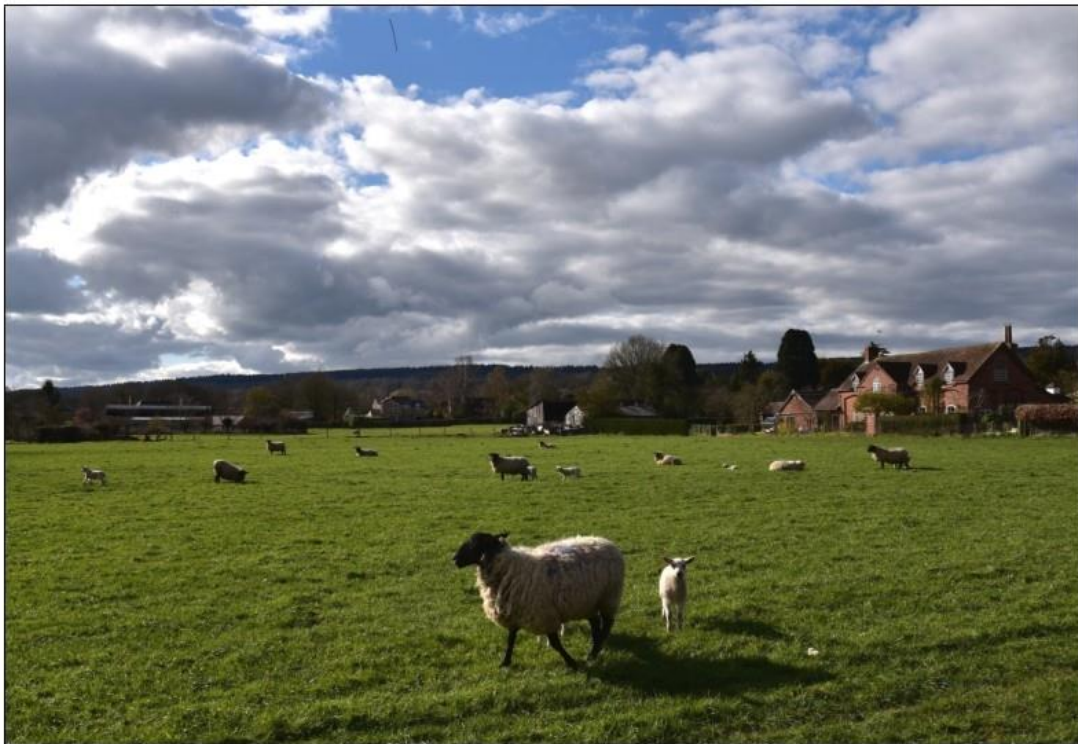
YARPOLE Lower House / Brookhouse Farms

location within the nucleated historic core. Herefordshire Council has produced a Supplementary Planning Document on archaeology and development which provides guidance on this matter.