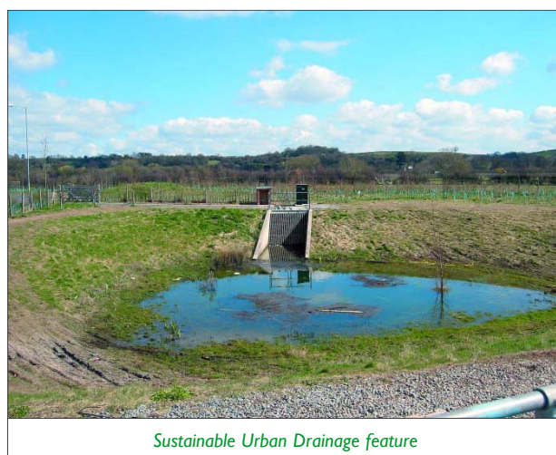
Sustainable Urban Drainage feature

Herefordshire Council will examine all proposals for SUDS and judge them on their merits. Permeability tests and hydrology surveys will be required to verify the suitability of the designs and commuted sums will be required for ongoing maintenance