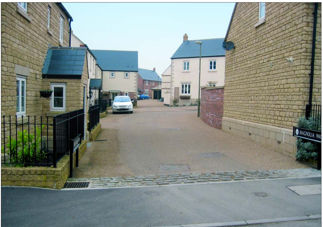
Home Zone Entry Point