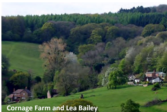
Cornage Farm and Lea Bailey

There are a number of views in and around the parish which should be protected; some long distance and some created by the undulations in the landscape (see pictures). Those highlighted in our questionnaire and noted in the Data Orchard report are shown in Appendix C.