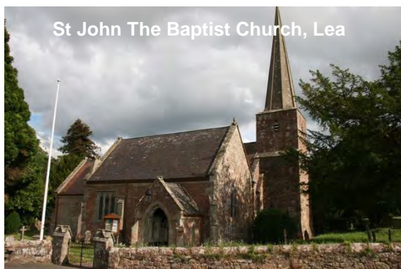
St John The Baptist Church, Lea