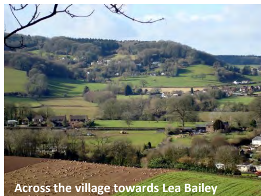
Across the village towards Lea Bailey

The village dates back to the 16 th century and nestles into the terrain, sheltered on one side by Lea Bailey Hill, with Crews Hill also providing a backdrop. Lea is situated in rural countryside, maintaining its rural roots.