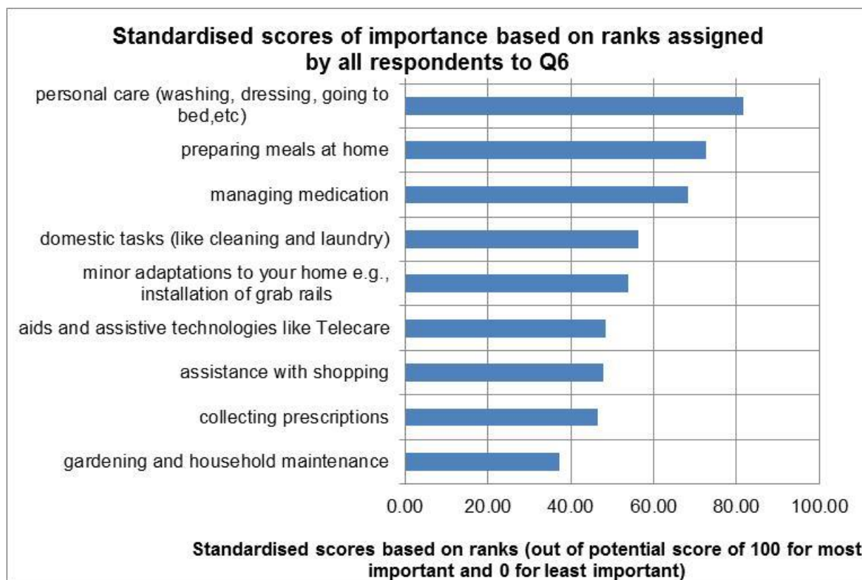
Chart 3: Standardised scores of importance based on ranks assigned by respondents to Q6

There are clear messages from the ranking. These include: (see table 6)