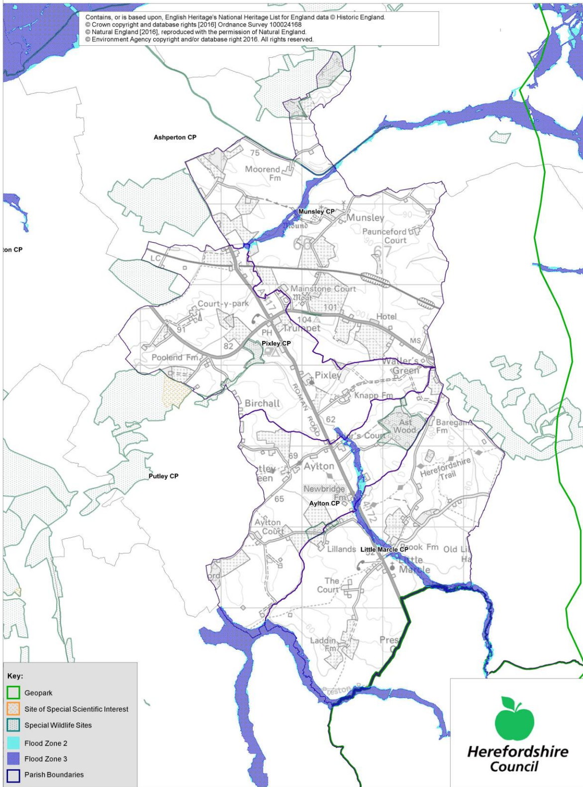
Plan 3: Pixley and District Group SEA, Minerals, Biodiversity and Flood Zones.