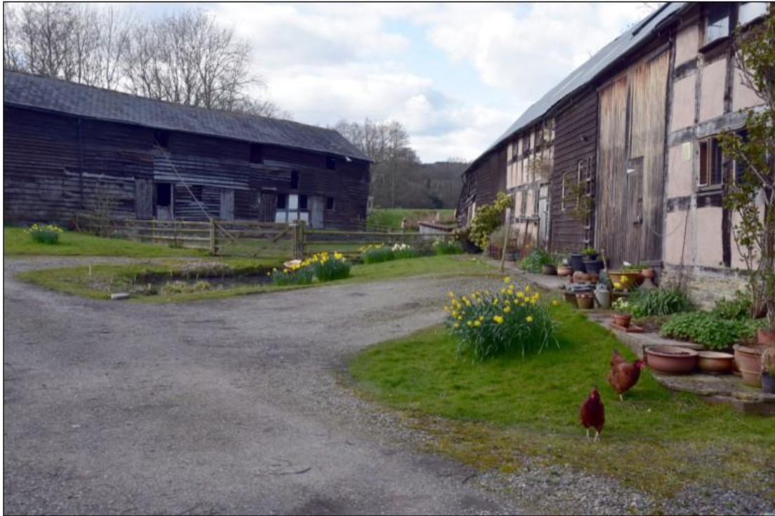
YARPOLE Church Farm

b) New housing upon this site should meet the needs of the community in terms of size by including a mix of properties including predominantly small and medium sized family homes in order to address needs identified within the Local Housing Market Assessment (see Table 2). The developer should indicate how it is proposed to contribute towards the needs identified, particularly in terms of house size. Departure from proportional needs may be accepted where development provides especially for particular local community.