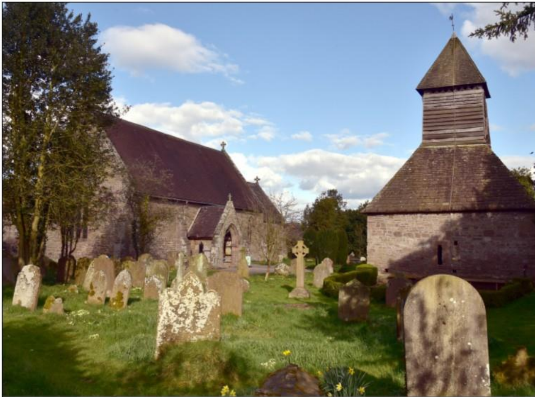
YARPOLE Saint Leonards Church and Belltower

6.14 Both the land in front of Vicarage Farm and that opposite comprising the graveyard with the old orchard towards Brook House contribute to an open green space within the village centre in the foreground of St. Leonard's Church. St. Leonard's Church is a Grade II* Listed Building while the separate square tower just to its south is Grade I. The majority of buildings which surround this space are also Listed Buildings. This policy therefore seeks to protect the setting of these Listed Buildings as well as the retention of green infrastructure.