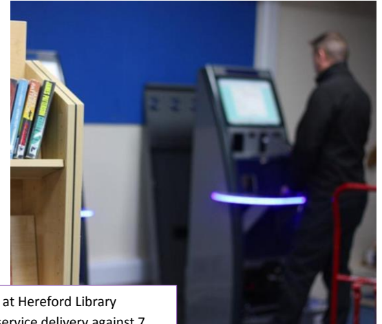
Photo: self-serve at Hereford Library (above); Library service delivery against 7 outcomes “Library Delivery” Libraries Taskforce 2017.