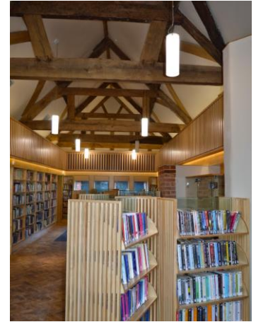
Ledbury Library in the Masters House as part of major development in 2015

This document outlines Herefordshire Council's plans for library services during the next few years; recognising the value to individuals and communities along with opportunities to support the wider objectives of the council.