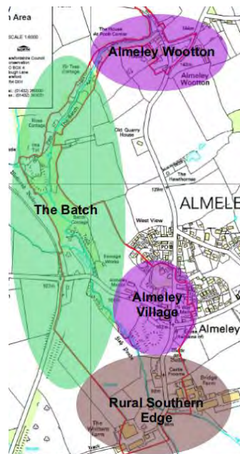
Diagram 1 – Almeley Conservation Area – Character Areas