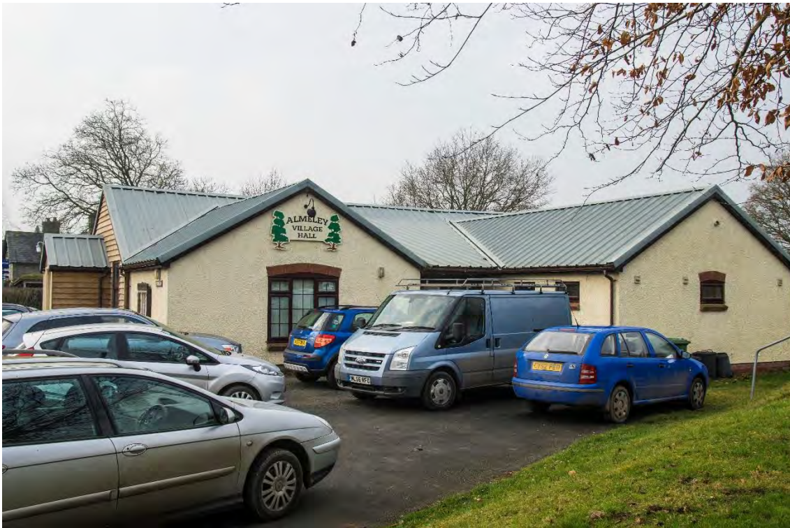
Figure 14: Almeley Village Hall