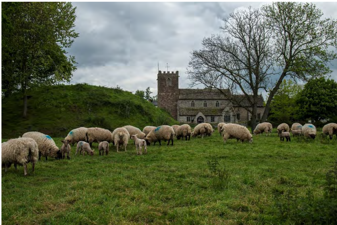
Figure 13: Farming is integral to the character of the Parish and its settlements.

7.2 This policy supports the use of large properties as well as redundant rural buildings for employment uses. The benefits are considerable in that providing jobs and new houses go hand in hand in supporting the retention of rural facilities such as schools, shops, public houses, which in turn support the overall sustainability of the countryside. Although Herefordshire Council acknowledges certain types of businesses assist rural diversification such as the knowledge based creative industries and environmental technologies, there are other form of traditional activities that may be equally acceptable for rural buildings such as those that support the agricultural industry itself. They may not be as tidy as more modern economic activities but are no less essential. Examples of those traditionally found in the area include agricultural contracting, machinery repair, food preparation, and small-scale farm building manufacture. They should be encouraged where their adverse effects on the environment can be mitigated through location and design. This is particularly relevant at this time within the Parish where an anticipated loss in farm-based agricultural employment is likely.