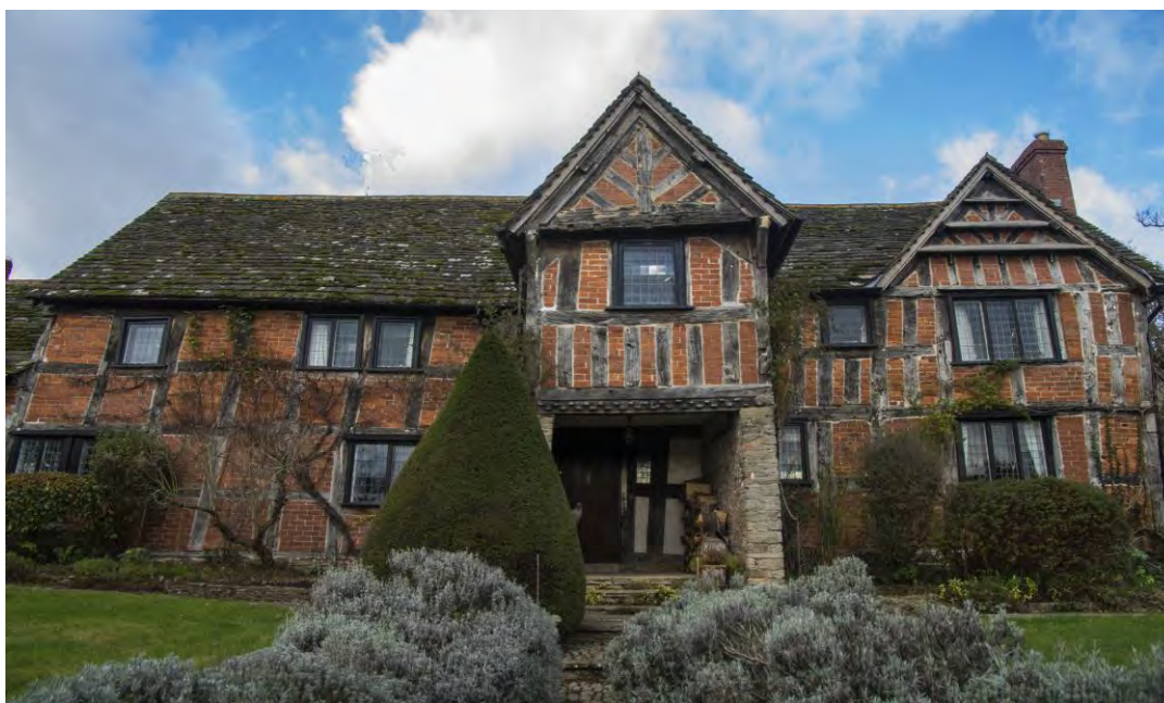
Figure 8: Almeley 15 th Century Manor House

6.4 Historic England has sponsored a project to characterise the historic farmsteads within the County and it is understood it would like to see a positive approach to their conservation. Historic farmsteads are particularly important to the local settlement pattern reflecting its dispersed character. The project has identified that Herefordshire's