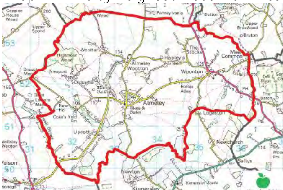
Map 1 – Almeley Neighbourhood Plan Area