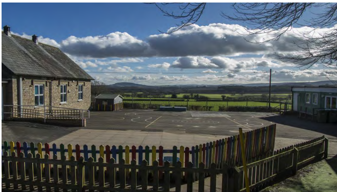
Figure 7: Unspoilt view across to the Brecon Beacons National Park from Almeley Primary School

ecological network of sites, wildlife corridors and stepping stones for the Parish current at the time 10 .