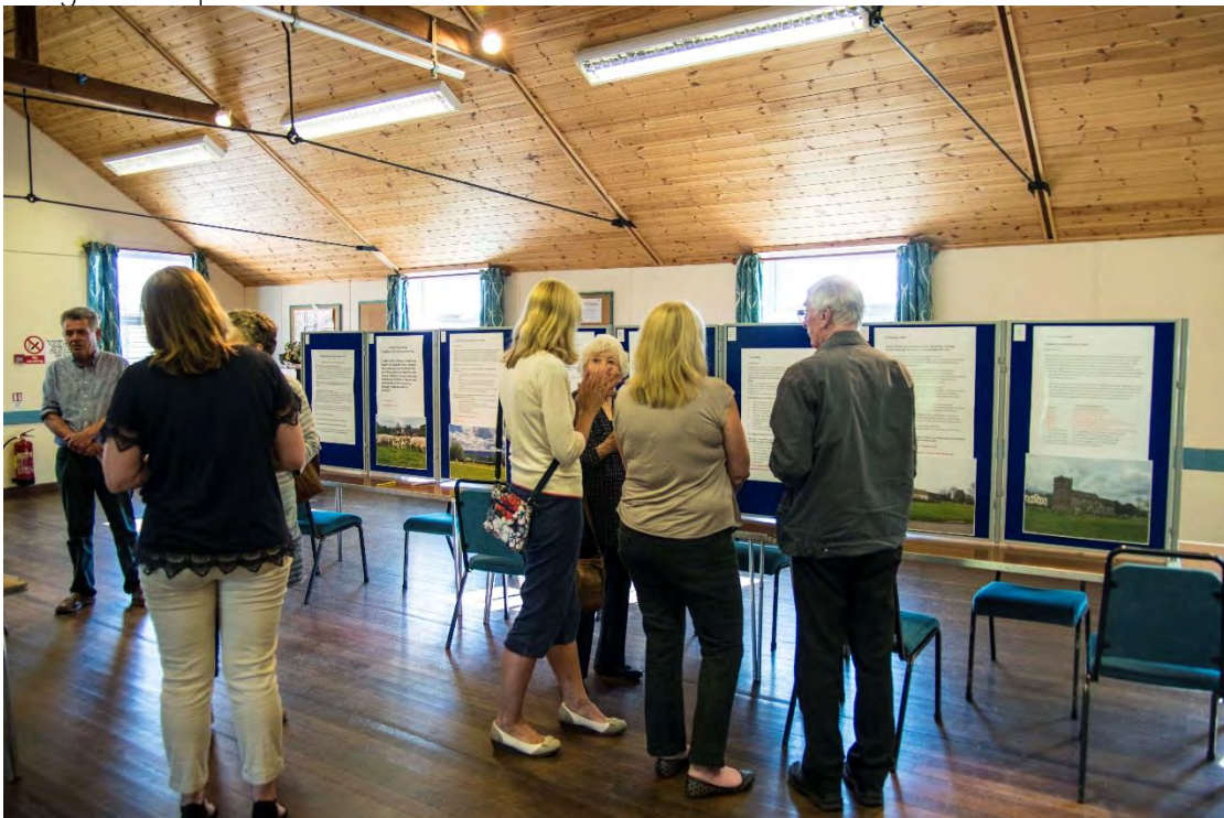
Figure 1: NDP Presentation Event