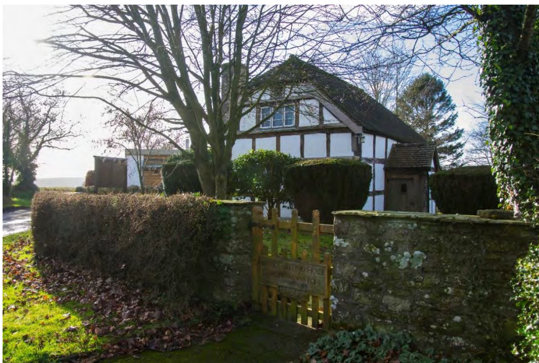
Figure 2: Quaker 17 th Century Meeting House, Almeley Wootton