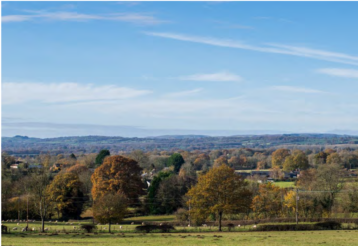
Figure 4: Rural setting of Woonton hamlet

Farm, The Batch and Almeley Wootton. Appendix 1 sets out a more detailed appraisal of the Conservation Area.