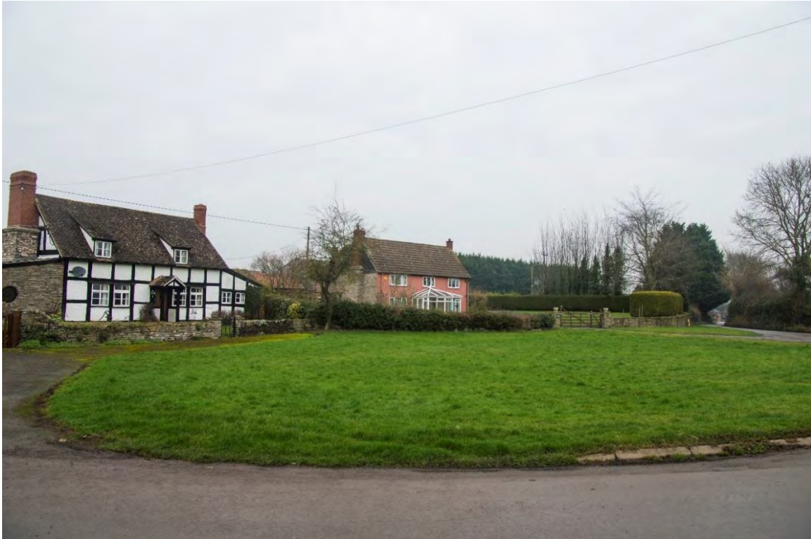
Figure 11: Pool Common, Woonton

reaching panoramic views stretching from Yazor Woods in the south-east to the Brecon Beacons in the south-west.