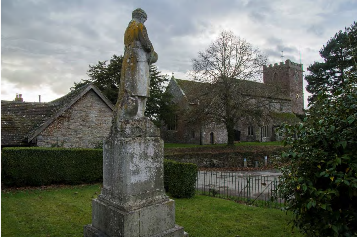
Figure 3: Almeley Church

2.24 Almeley Conservation Area was designated in 1987. It includes not only the historic portion of Almeley village but also The Batch and Almeley Wootton. Herefordshire Council prepared a draft appraisal for this area in 2006 although did not adopt this.