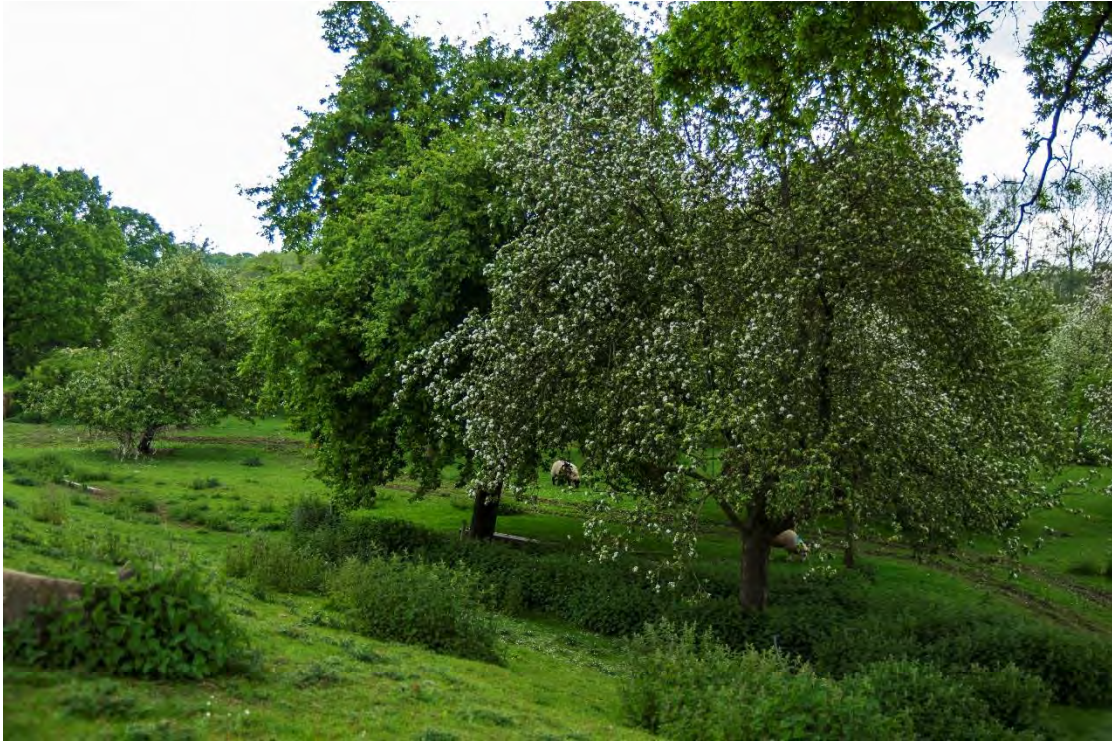
Figure 6: Traditional Orchards add significantly to local biodiversity