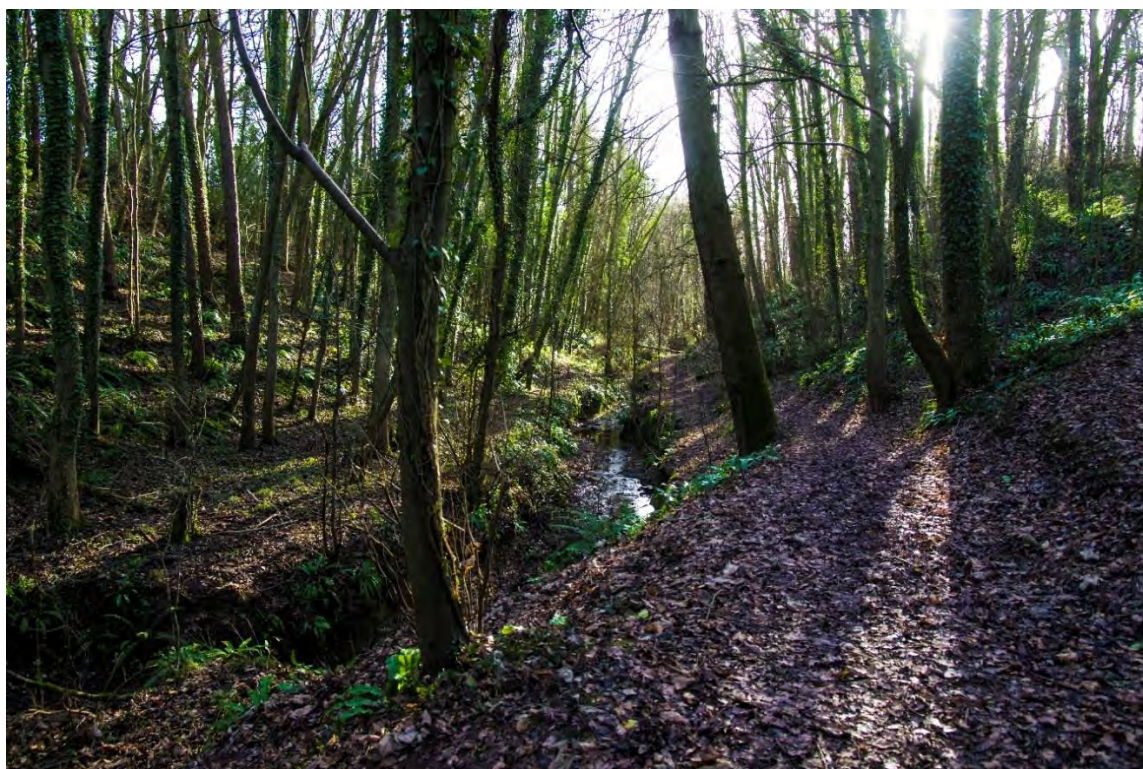
Figure 10: The Batch, Almeley