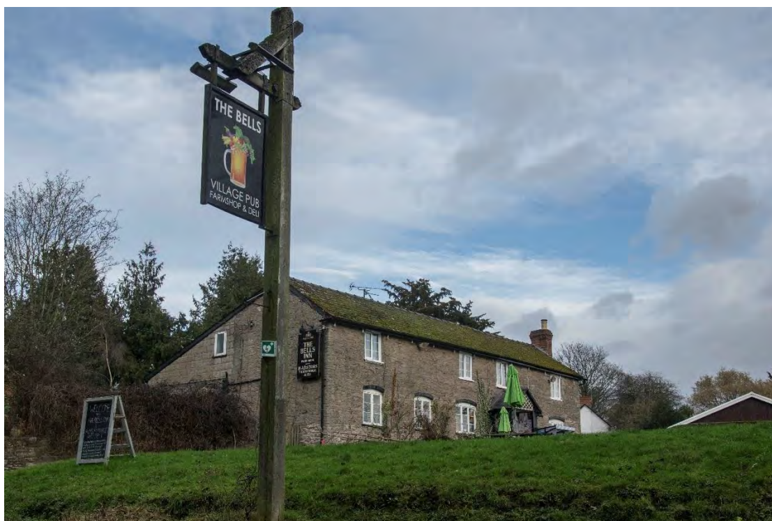
Figure 5: The Bells, Almeley