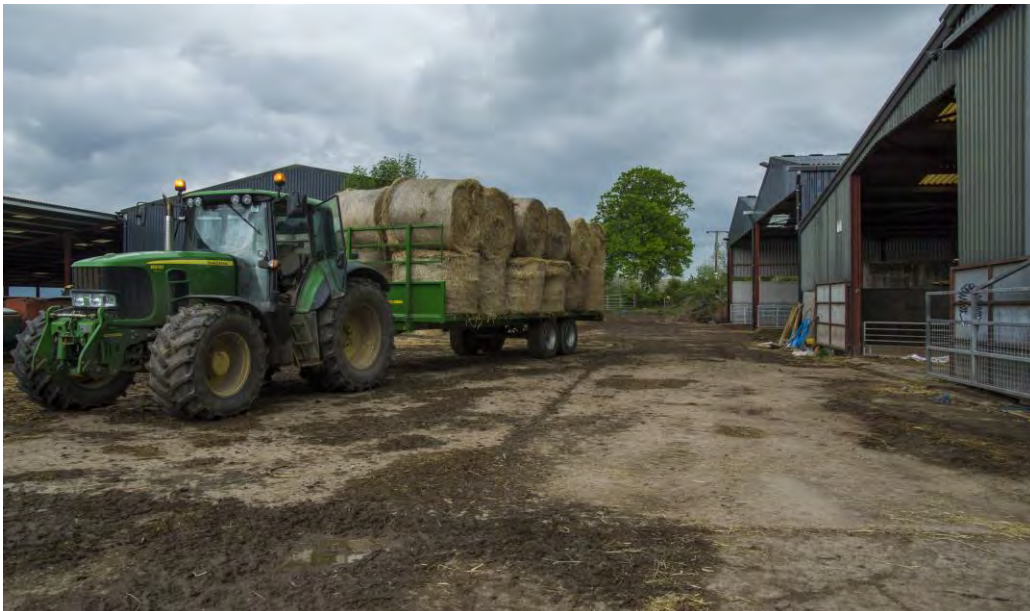
Figure 12 – Farming is key to the economy of Almeley Parish