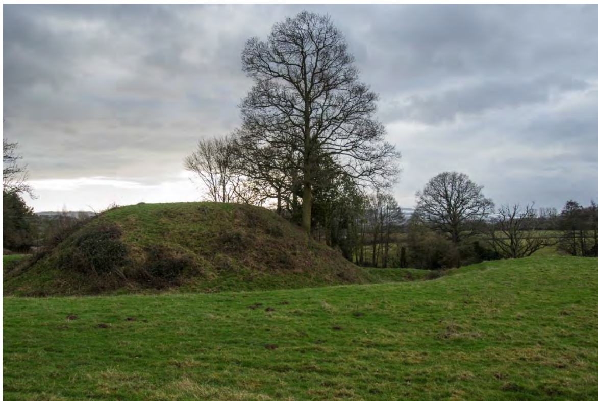
Figure 9: Remains of Almeley Motte and Bailey – Scheduled Ancient Monument