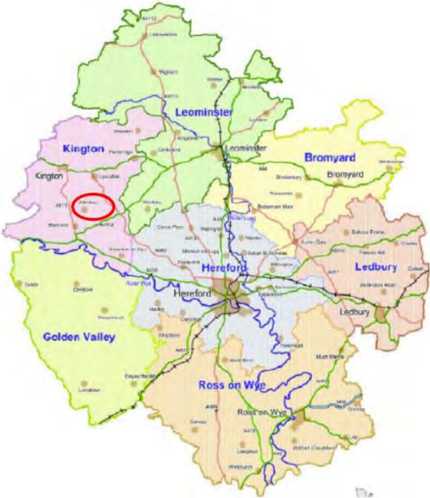
Figure 2 - Location of Almeley Parish within Kington Housing Market Area.

© Crown copyright and database rights (2015) Ordnance Survey (10003431)