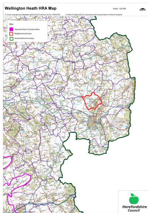
Figure 2 –Wellington Heath Neighbourhood Area and European sites.