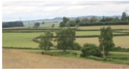
Viewpoint H8 Grid Ref SO66002092