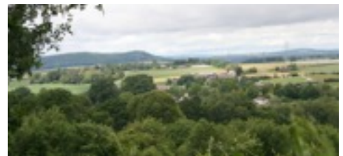
F Views from Gypsy Lane over surrounding countryside:

(Note: views from this location are currently compromised by polytunnels which are presumably temporary.)