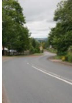
E View on the left as you leave the village towards Aston Ingham: