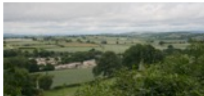
Viewpoint E Grid Ref SO66882142