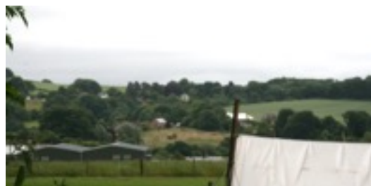
Viewpoint F Grid Ref SO65632205

(Note: views from this location are currently compromised by polytunnels which are presumably temporary.)