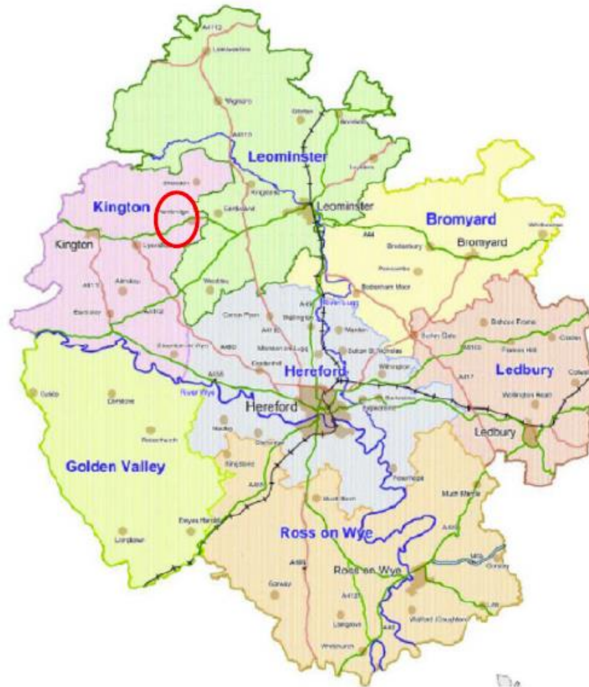
Figure 2 - Location of Pembridge Parish within Kington Housing Market Area.