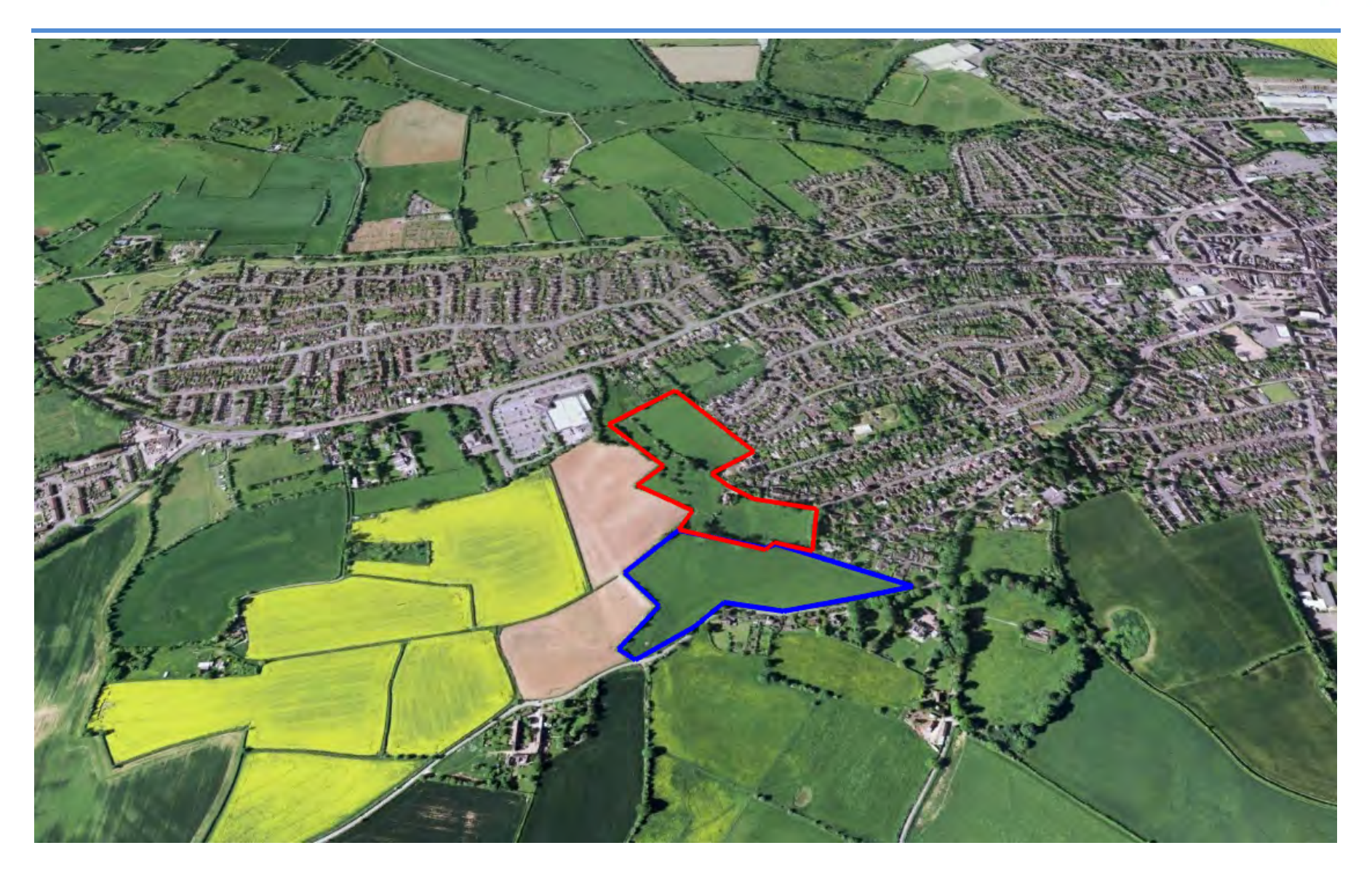
Appendix 1 Mr Porter and his neighbour's land (edged red and blue respectively)