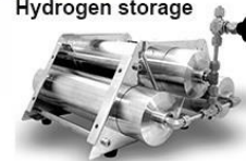
Estate Hydrogen storage

Each Hydrogen Cell car is connected to the home circuit via a drive over garage floor connection. Power generated by the car feeds directly to the home circuit and excess power to a centralised estate distribution circuit.