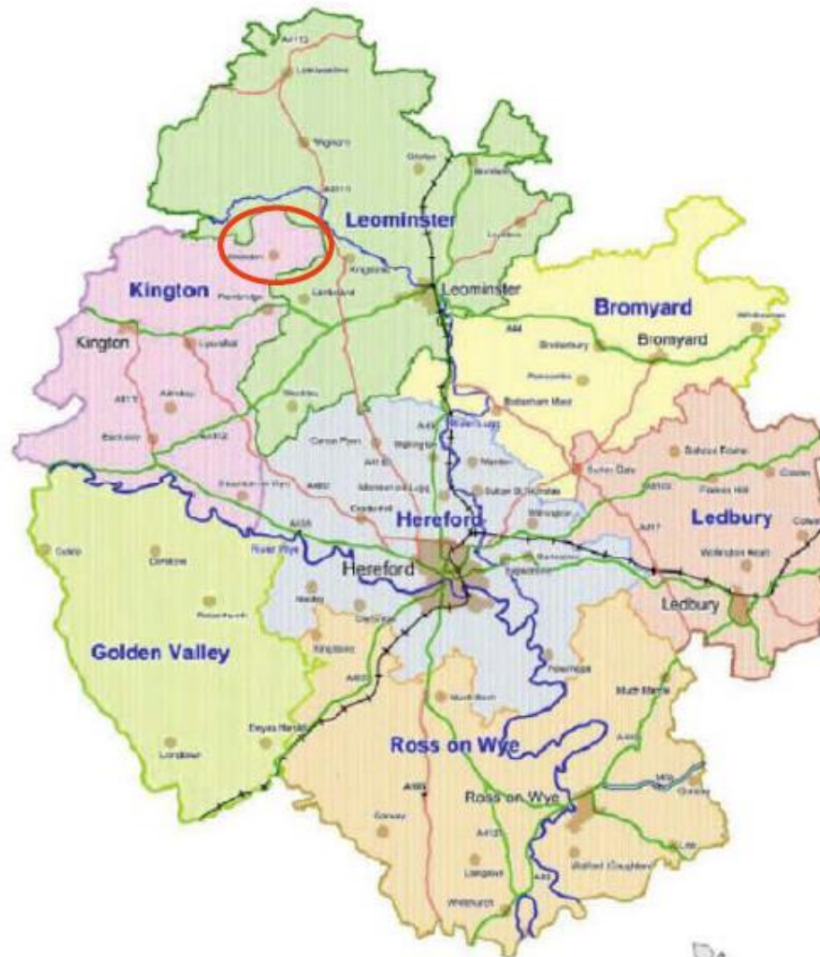
Figure 2 – Location of Shobdon Parish within Kington Housing Market Area.