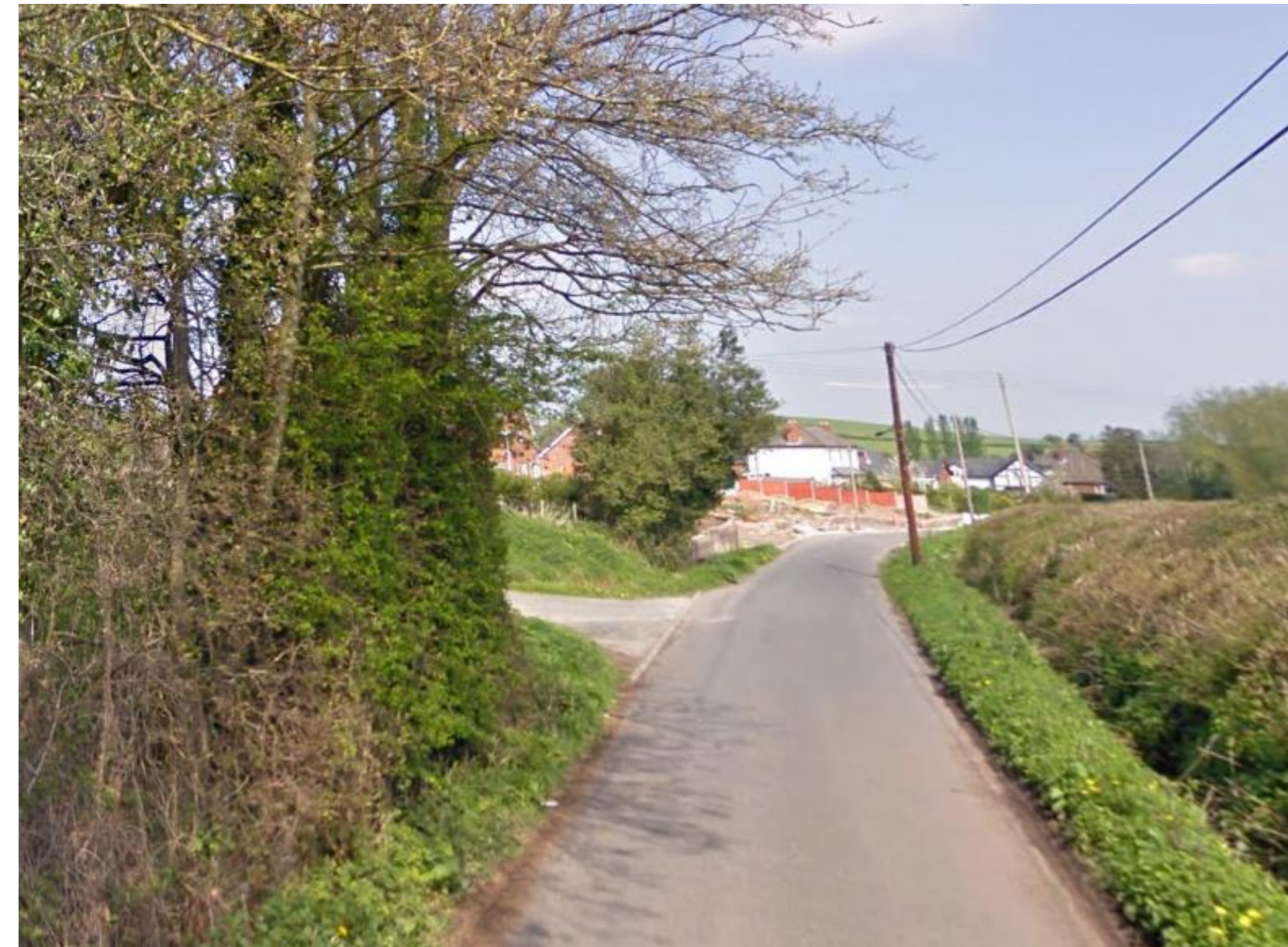
Location of reminder feature at entrance to Shelwick