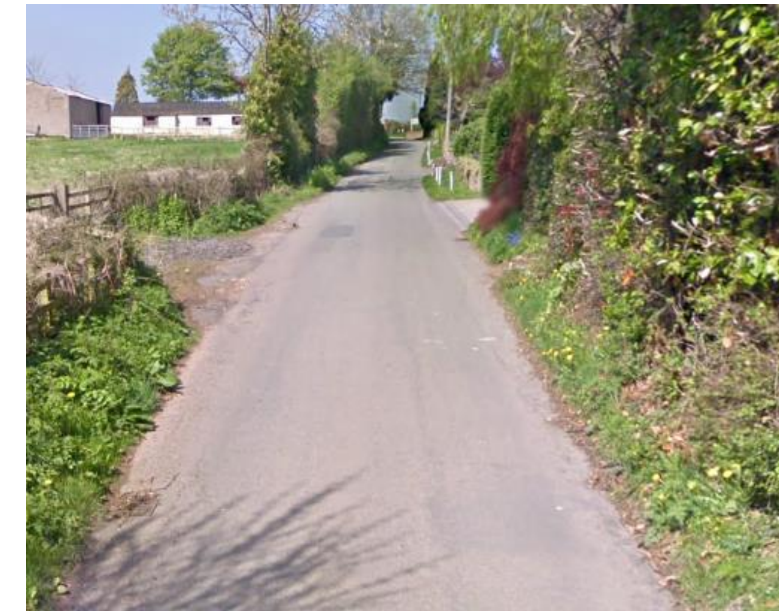
Location of reminder feature south of Lyde Cross