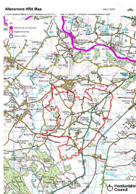
Figure 2 below highlights the location of the River Wye SAC in relation to the Allensmore neighbourhood area