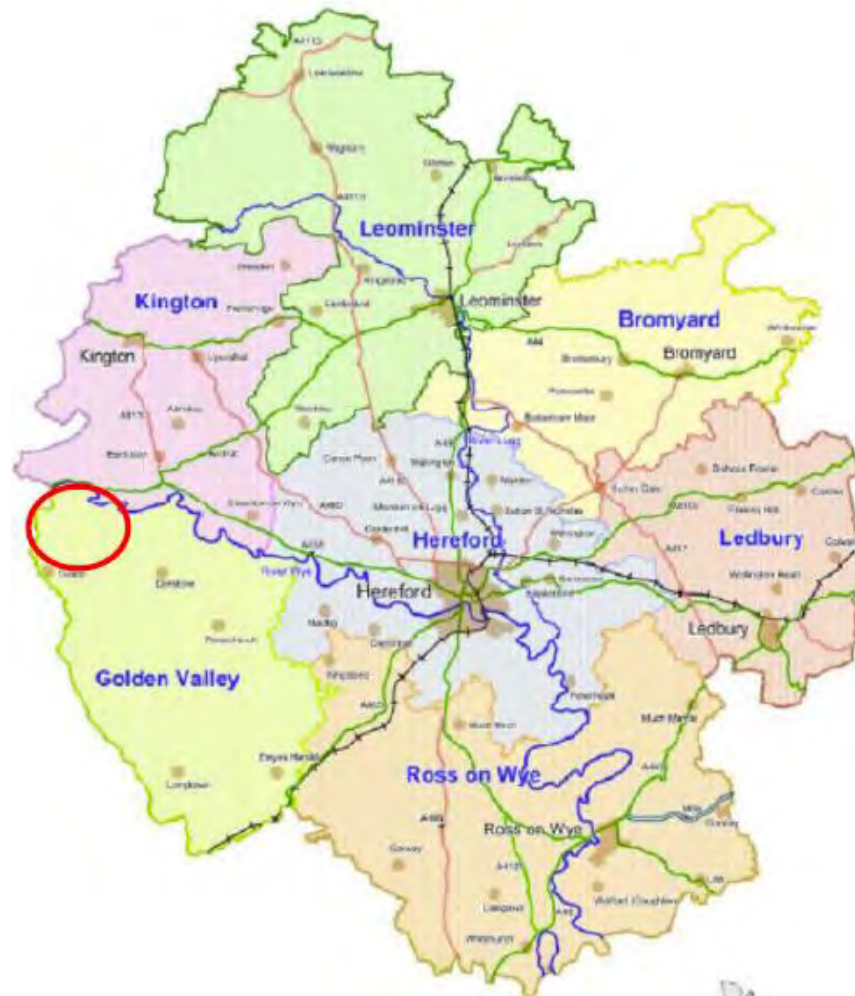
Figure 2 - Location of Clifford Parish within Golden Valley Housing Market Area.