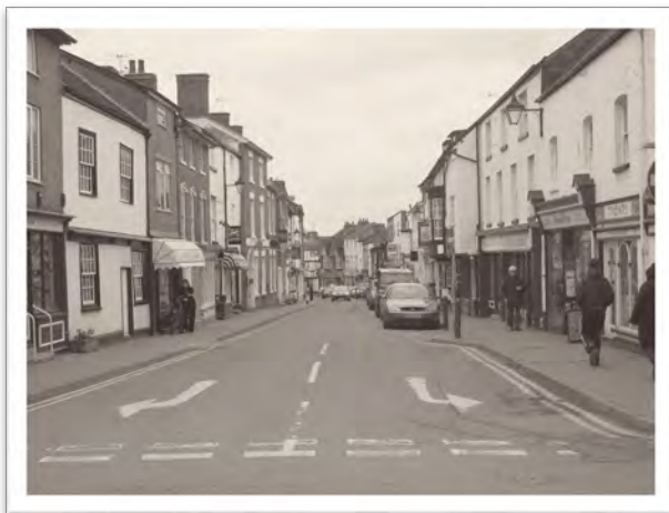
Bromyard High Street

Primary or Secondary Street that acts as a focus of retail and other services