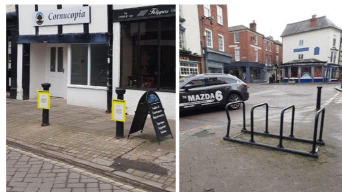
Inappropriate and poorly maintained street furniture