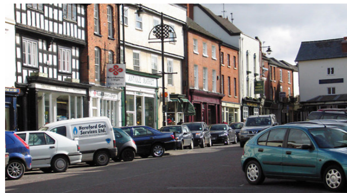
Car dominated streets and parking on both sides