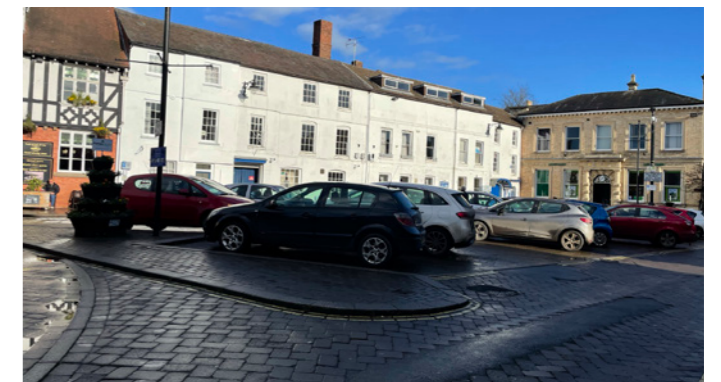
Car dominated civic spaces