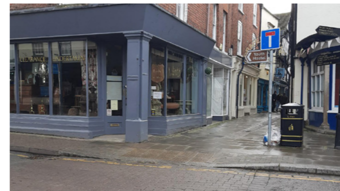
Lack of wayfinding signage at important junctions