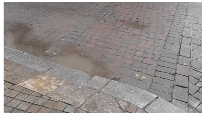
Poor paving surfaces and water puddling