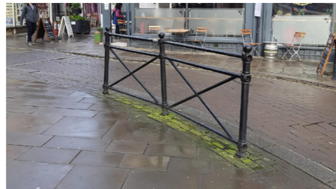
Physical barriers sever key walking routes