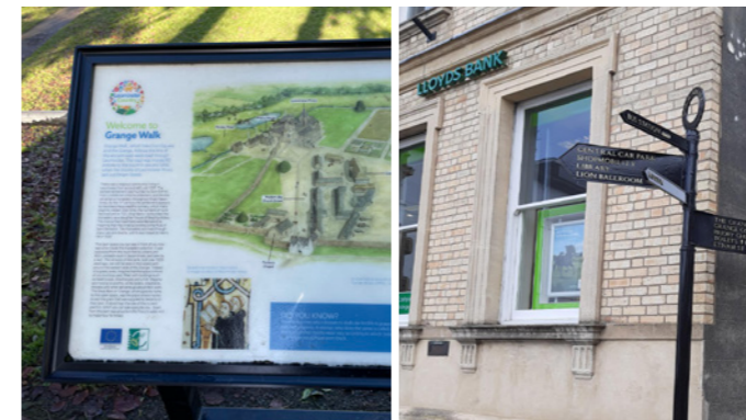
Not enough signage to tell Leominster's story