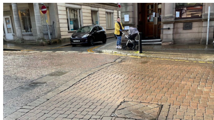
Speeding cars and inconsiderate driving