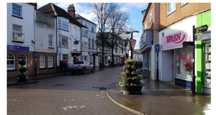
Underused public areas