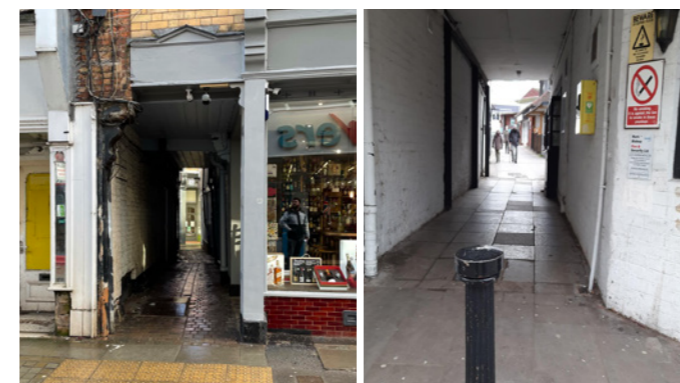
Dark and uninviting passageways