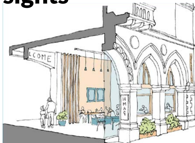
Behind the scenes at the museum – this architect's concept drawing shows what a rooftop terrace could look like within a renovated building in Hereford's Broad Street