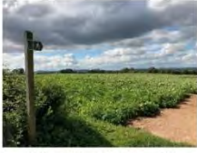
LV1: north towards Dinmore Hill