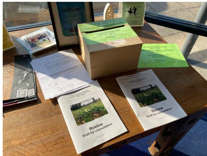
Regulation 14 consultation material at Bartestree Village Hall