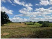
LV3: south towards Hampton Bishop