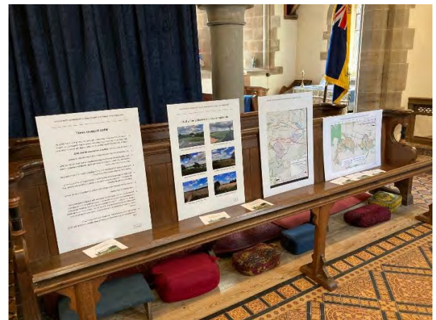
Drop-in events at Lugwardine (above) and Bartestree (below left), and display banner at Bartestree.