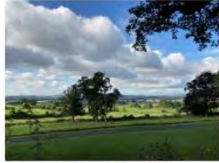
LV4: south-west over the River Lugg