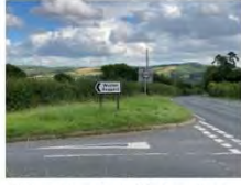
LV2: east towards the Woolhope Dome