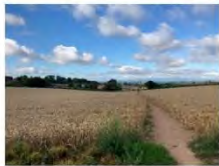
LV6: west towards Lugwardine