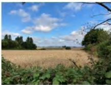
LV5: north-west towards Dinmore Hill