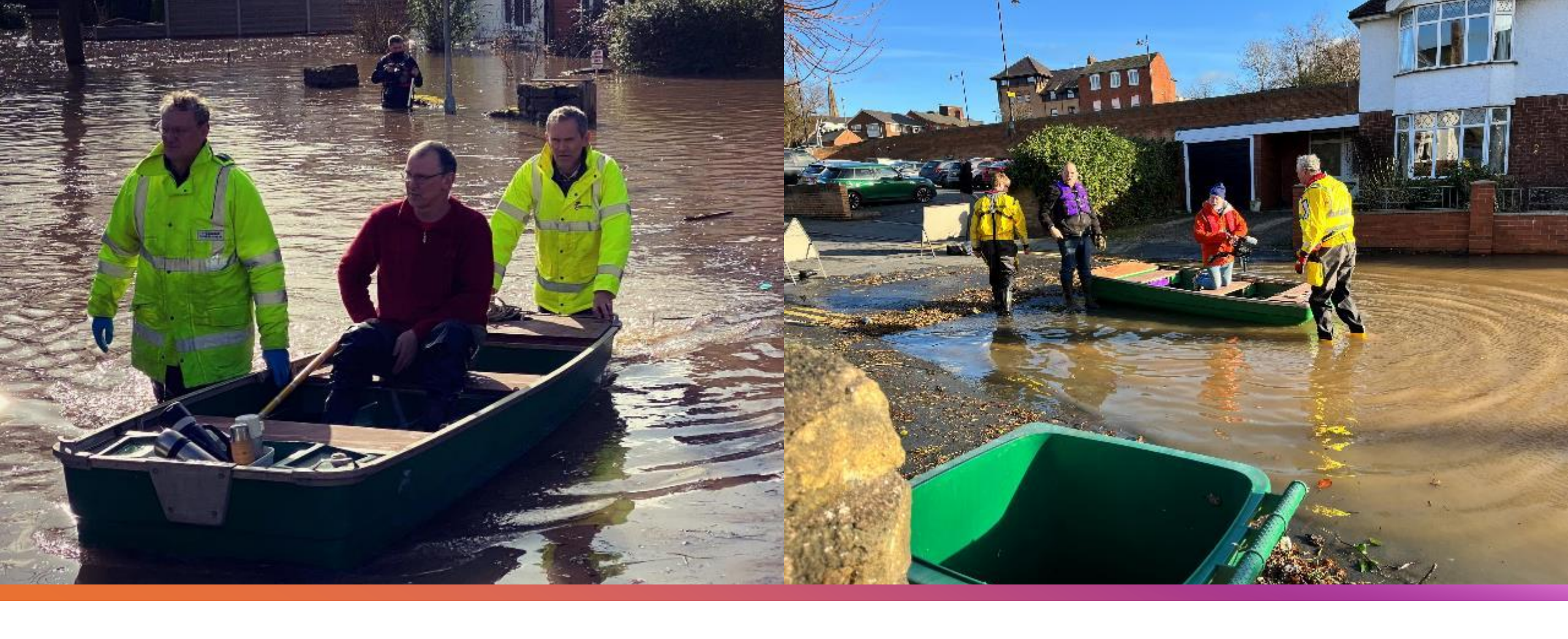
Kit & Training