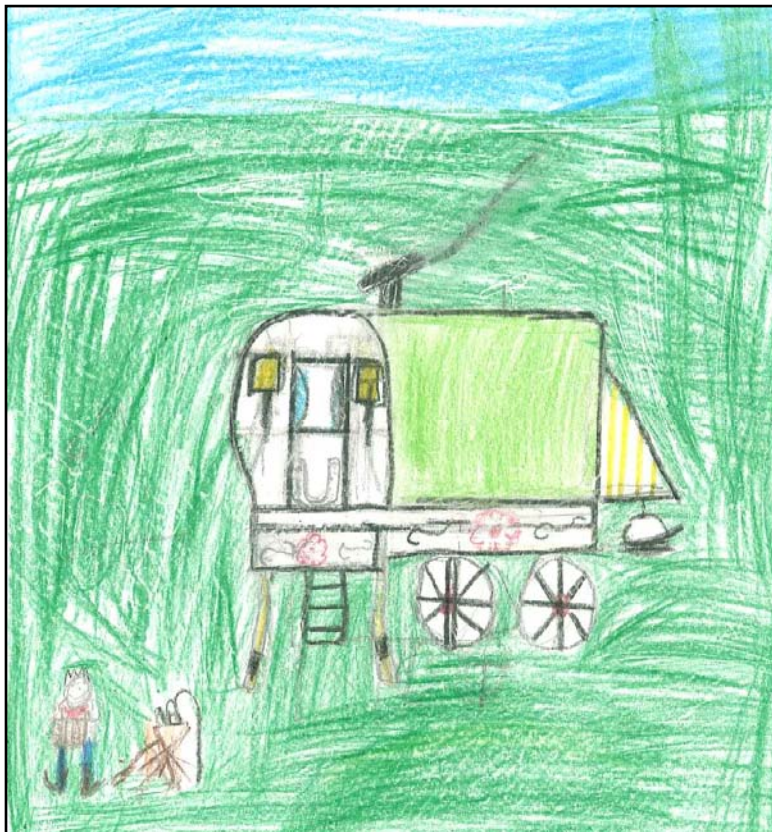
(The Caravan Site, Manor House Lane)

REVISED FINAL REPORT JULY 2008 WITH AMENDED PITCH FIGURES FOR HEREFORDSHIRE