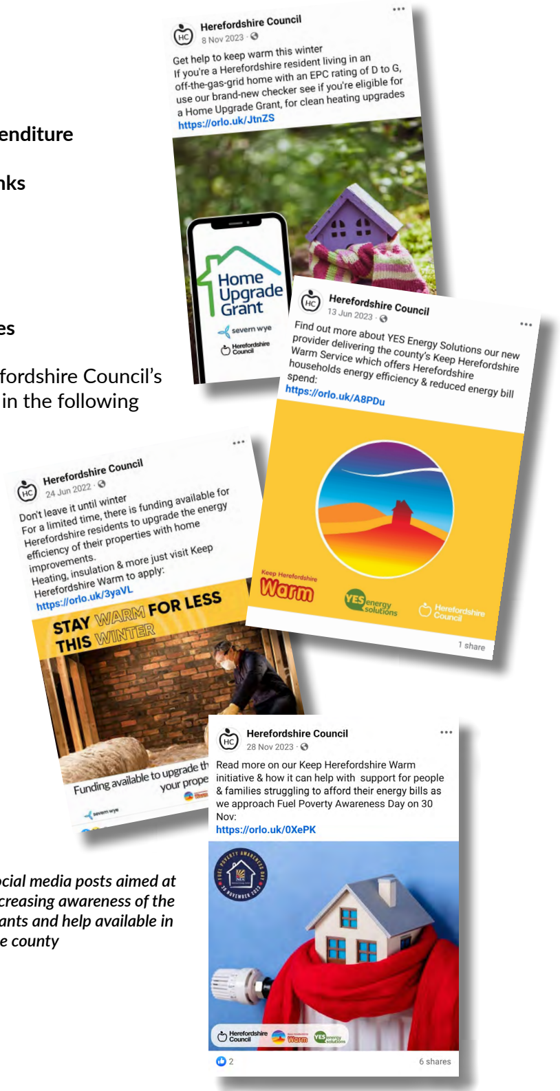
Social media posts aimed at increasing awareness of the grants and help available in the county

These actions will be delivered through Herefordshire Council's Keep Herefordshire Warm Service as set out in the following section.