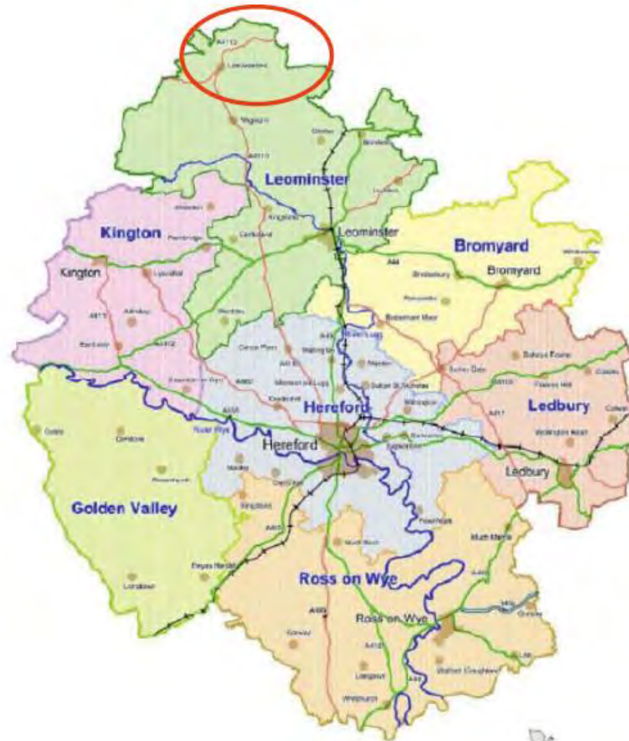
Figure 2 - Location of Leintwardine Group Parish within Leominster Housing Market Area.