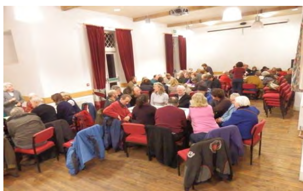
Fig 2 – First public event, January 2013

The first public meeting took place in January 2013. Fig. 2. Its main purpose was to launch the process publicly, identify important issues and formally establish a Steering Group. The opportunity was also taken to gather in the thoughts of attendees on what they valued most about the parish and to log their key concerns and aspirations.