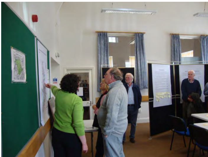
Fig 3 – Consultation event, May 2015

The consultation material developed for these events can be found at https://onedrive.live.com/redir?resid=61DD5919DE8D124E!125&authkey=!ANSw9a0DaRC-Dlw&ithint=file%2cdoc