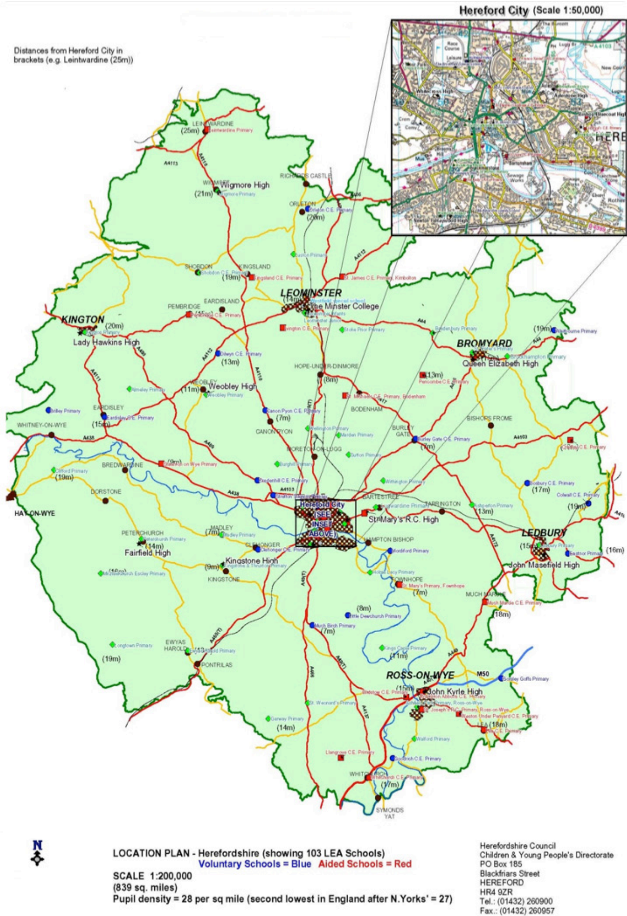
Figure 1 - Map of Herefordshire and school locations