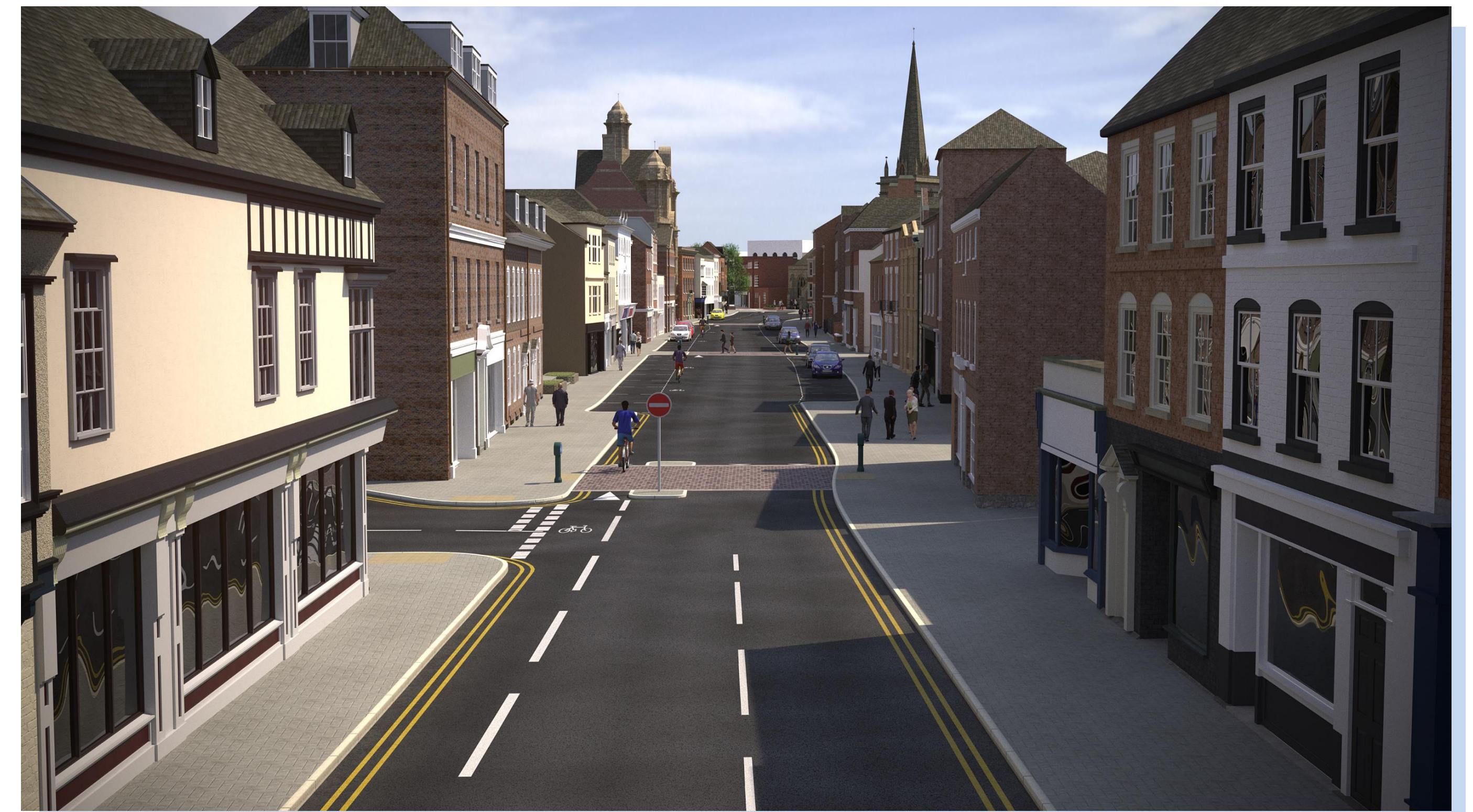
Transition between formal and informal cycle lane with raised crossing at Cantilupe Street and raised crossing at St Owens Mews beyond.