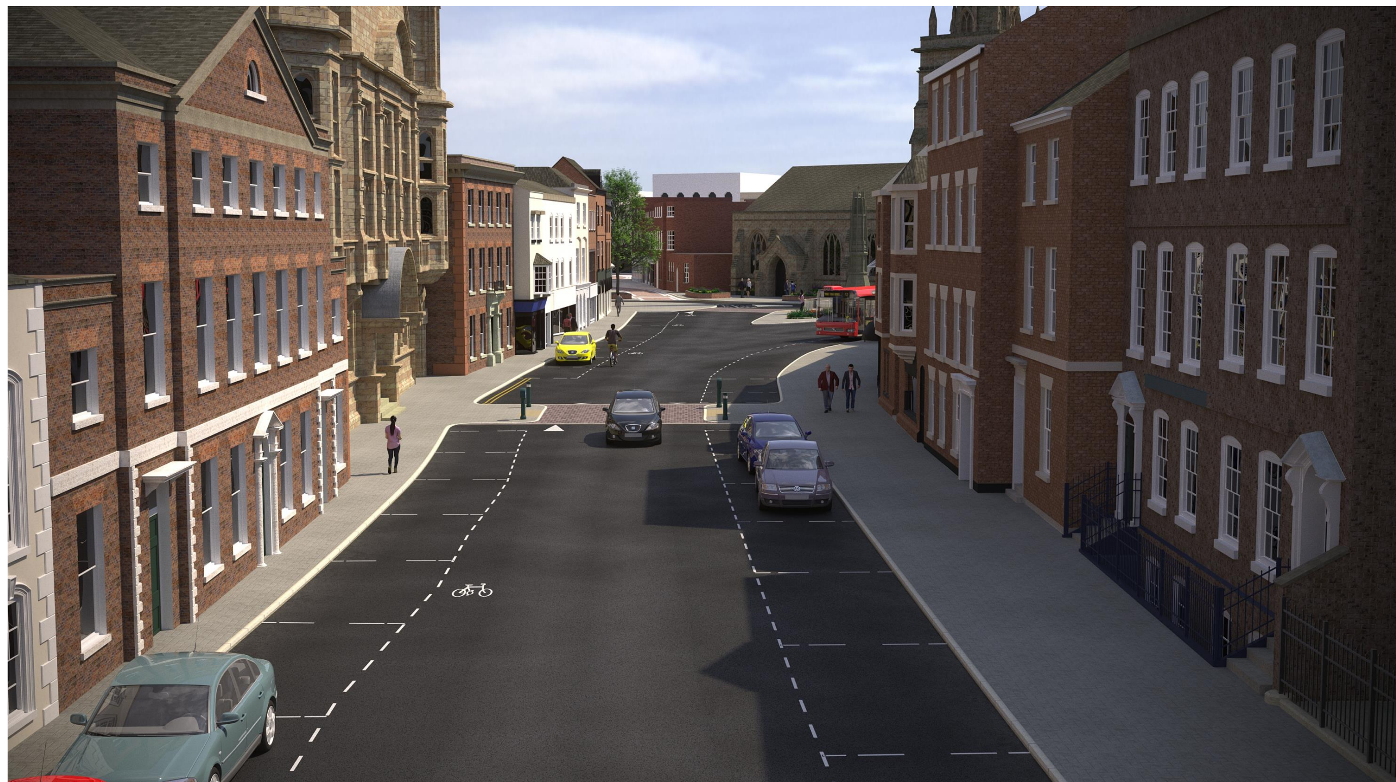
Informal cycle lane and raised crossing at Town Hall