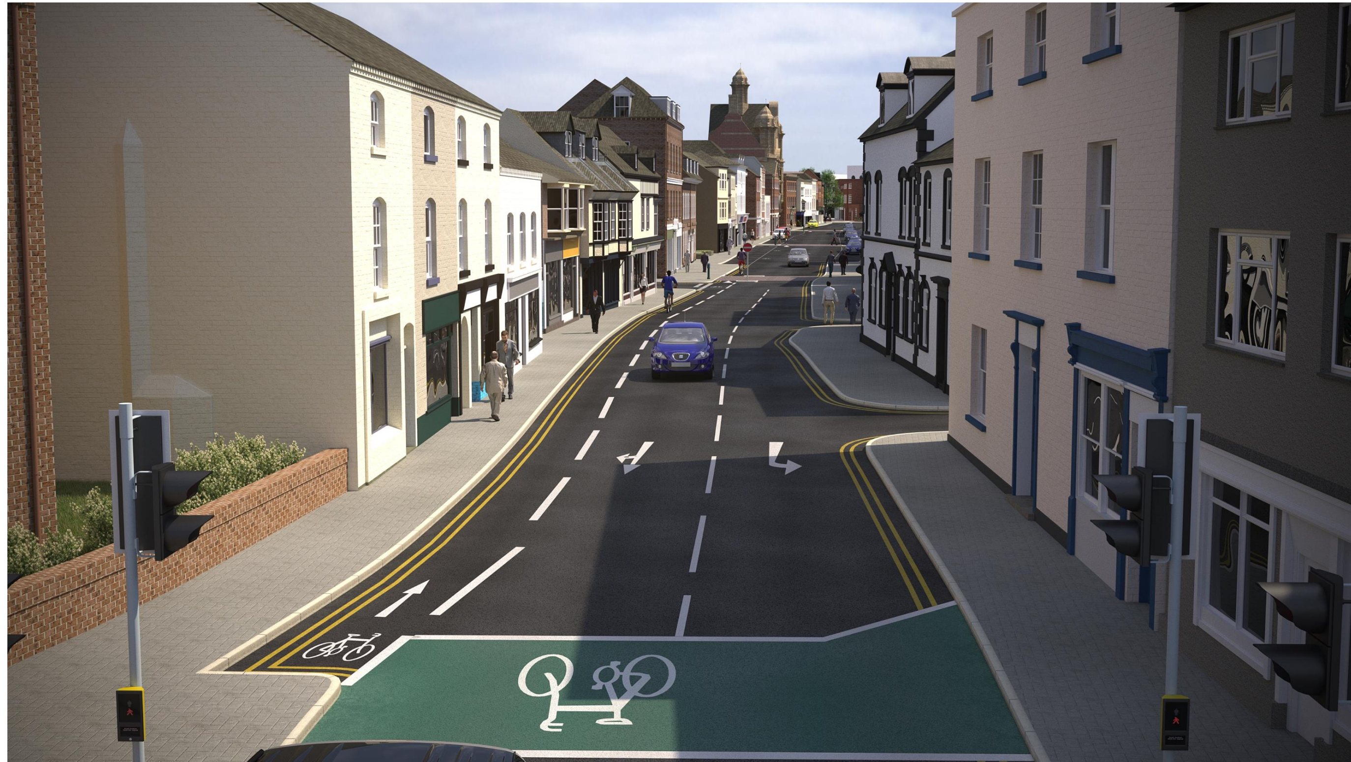
Formal cycle lane and controlled crossing at Bath Street Junction