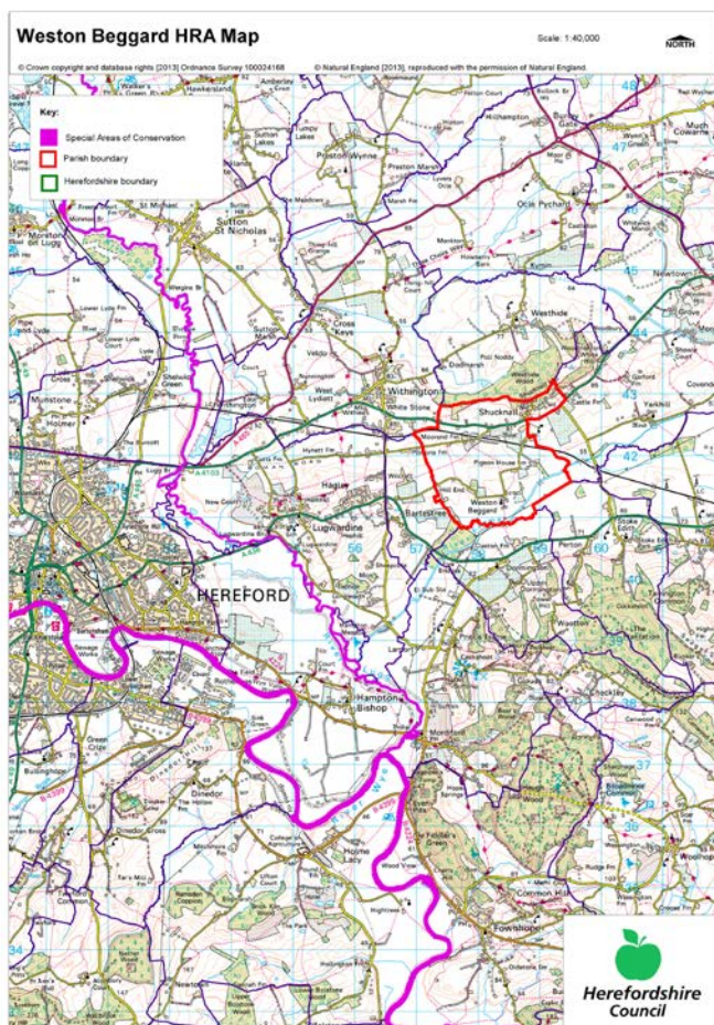
Figure 1- Weston Beggard HRA Map