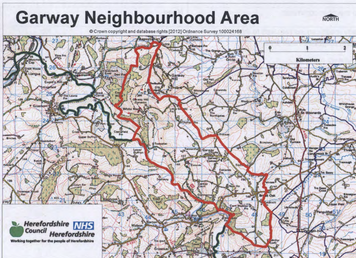
Map of proposed neighbourhood area